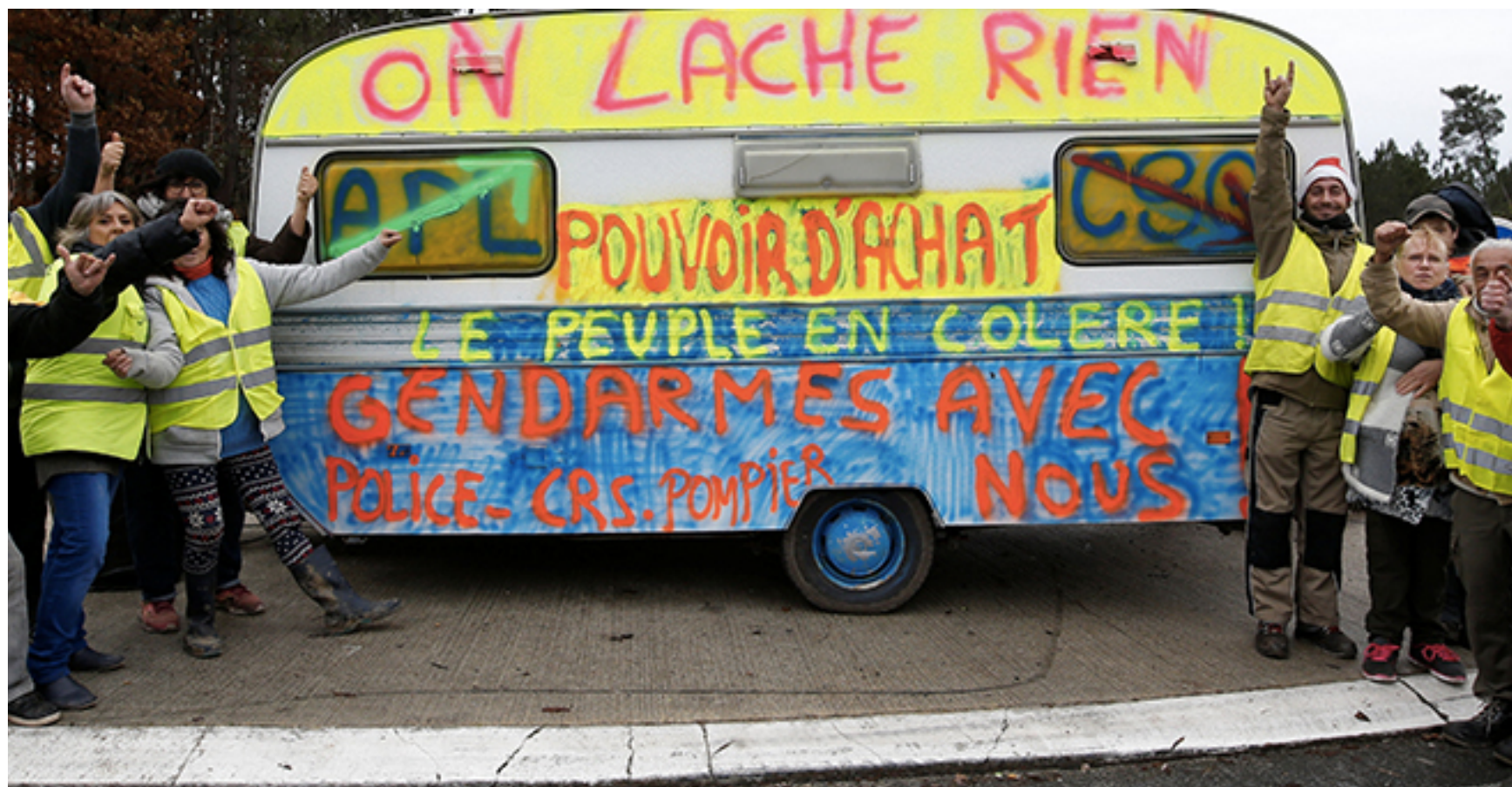
rassemblement sur un rond-point de Cissac-Médoc (Gironde), en décembre 2018.