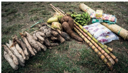
Gifts offered for traditional customary gesture, Gohapin Tribe, New Caledonia © IAC/N. Petit.

In Oceania, the most effective shared management approach is not based on a principle of compromise, but consensus. Negotiations can take a long time, but it is the only way to reach decisions and choices that are sufficiently sustainable and understood by all. In this context, participatory methods adapted to the Oceanian context can help to achieve optimal acceptability and involvement of the relevant stakeholders.