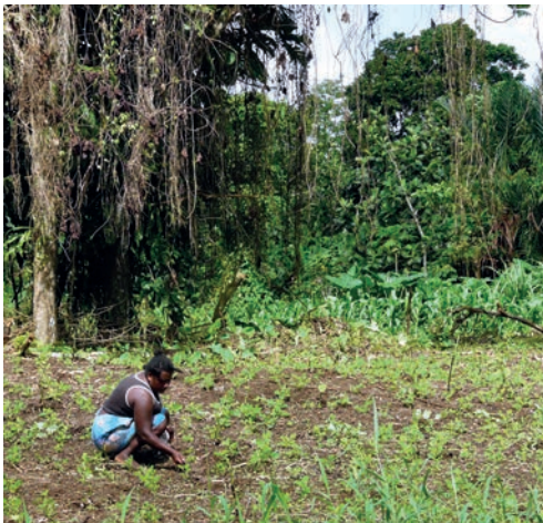
Traditional cultivated fields, Espiritu Santo Island, Vanuatu © IRD/H. Jourdan.

In terms of health, preserving biodiversity also means ensuring the sustainability of a healthy diet that is severely affected by the massive introduction of fatty and sweetened manufactured food products, leading to an explosion of non-communicable diseases, as illustrated by extremely worrying rates of obesity and diabetes in Oceania. Besides, biodiversity and related knowledge allow the persistence of traditional medicines that are primarily based on the pharmacopeias ritually mobilized daily.