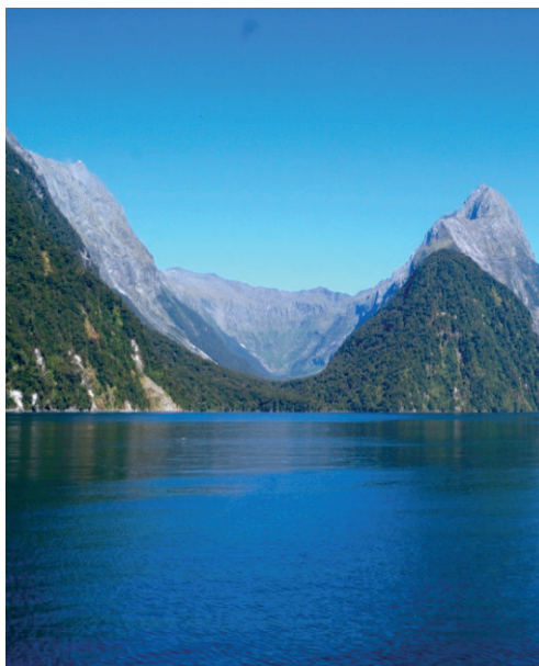
The Fjorland National Park, South Island, is the largest of the 14 national parks in New Zealand, with an area of 12,500 km 2 ©Lincks/E. Bonnet-Vidal.