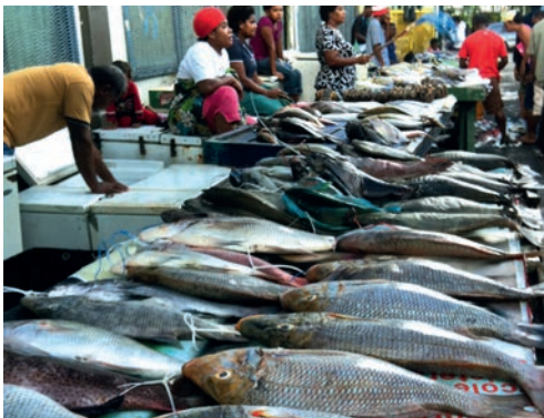
Fish market, Suva, Fiji © IRD/H. Jourdan.