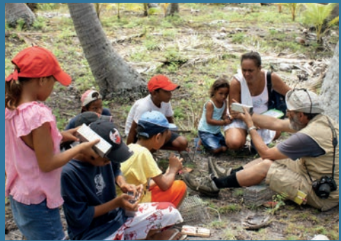
Niau Atoll is part of the Fakarava Biosphere Reserve, French Polynesia. School children learn how to set traps to catch introduced rodents