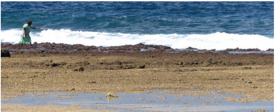
Woman angling from the shoreline on the east coast of Efate Island, Vanuatu © IRD/C. Sabinot.

When it comes to planning protected areas where biodiversity is relevant to traditional pharmacopeia or coastal fisheries, women are often a key group willing to share their knowledge. Their daily practice in fishing or gathering areas, their naturalistic knowledge, and know-how must contribute to the collective management of environments.