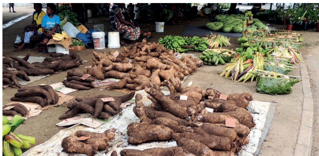
Efate market, Vanuatu