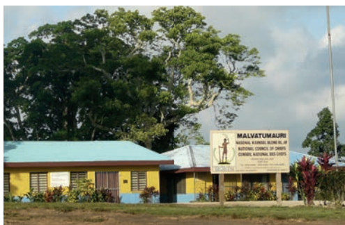
Chief Assembly Institution, Port Vila © IRD/H. Jourdan.

Customary authorities are often central to management policies, particularly for protected areas located on customary territories. Depending on the cases and local capacities, whether inspired or not by traditional management modalities, management systems remain empirical. These systems do not always respond to growing threats, and their effectiveness depends heavily on social and customary organizations and demographic pressures.