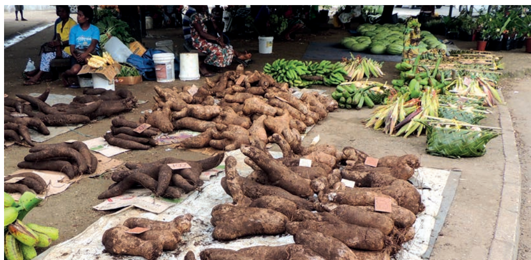
Efate market, Vanuatu