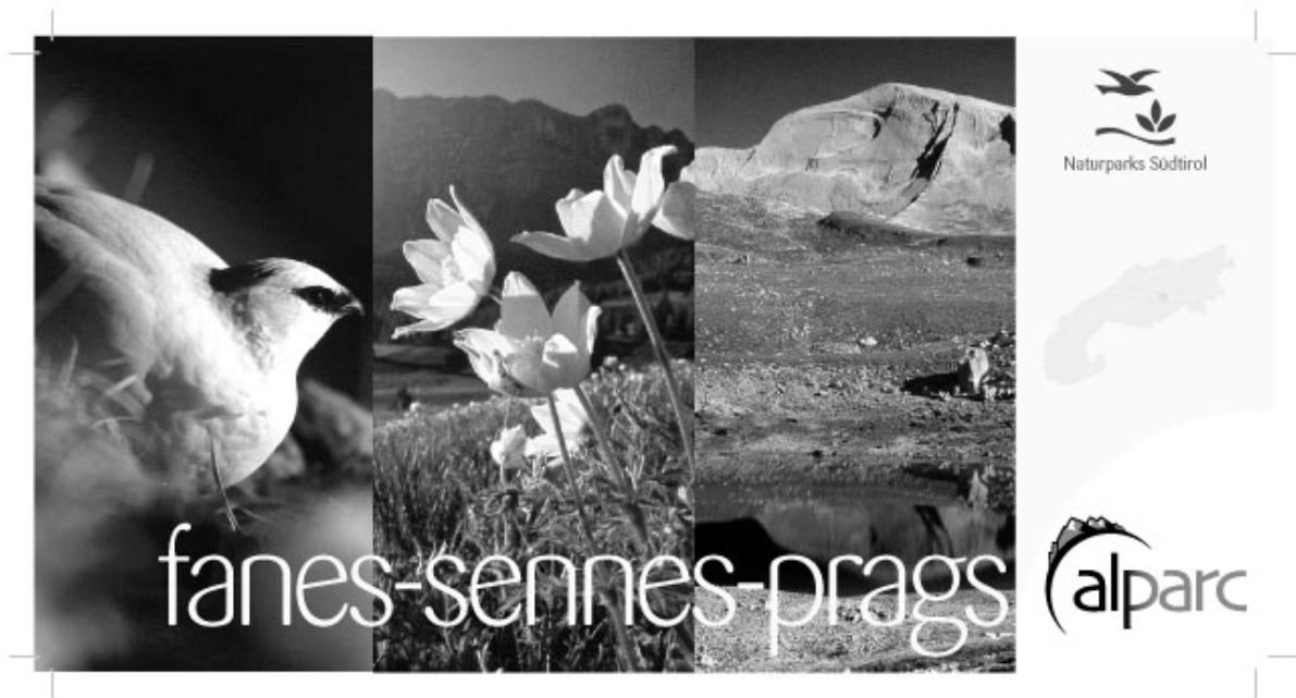
Figure 1: Postcard produced by Alparc, © Alparc 2008