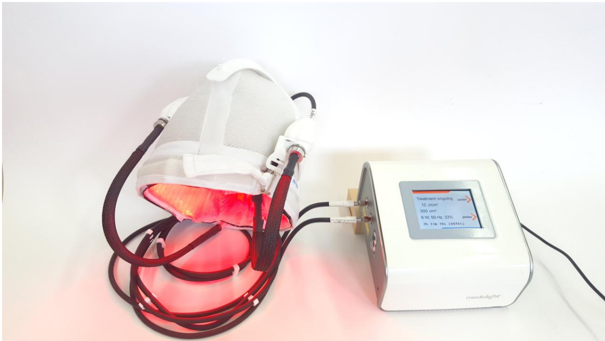
Figure 1: The light-emitting, fabric-based device involved in P-PDT: 635 nm red light is emitted at 1.3 \text{ mW/cm}^2 by a fibre optic based fabric that lines the inside of a cap.