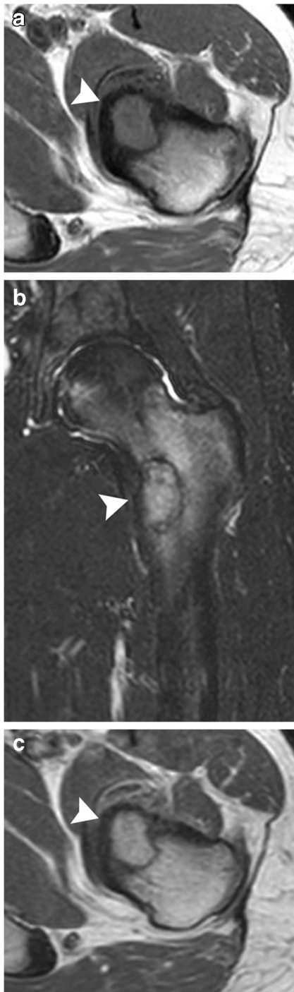
Fig. 2 At MR imaging, the lesion (arrowhead) presented nonspecific hypointense signal on T1-weighted spin echo images (a) and hyperintense signal on STIR (b) and was characterized by extensive surrounding bone marrow edema. After intravenous contrast injection (c), the tumor exhibited marked and homogenous enhancement

Because radiofrequency (RF) ablation is considered the standard treatment of osteoid osteoma, this heat-based technology was first investigated in the treatment of