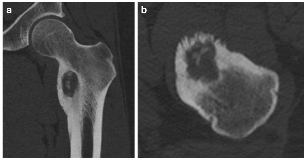
Fig. 1 Coronal (a) and horizontal (b) CT reformatted images demonstrating a slightly expansile, 4-cm osteolytic tumor with partial matrix mineralization and sclerotic margins involving the lesser trochanter

drill system ( Arrow OnControl Teleflex ) was used to insert three 10G biopsy needles into the bone up to the nidus margin with a lateral approach, which was agreed on with an oncology orthopedic surgeon to prevent complication if a different diagnosis was made at histological examination after cryoablation treatment. Bone biopsies were performed before ablation using a 12G trephine needle, not only to confirm diagnosis but also as part of the lesion access for the cryoprobe. Then, three cryoprobes, two Iceseeds, and one Icesphere ( BTG, Boston Scientific ), respectively, were placed coaxially within the nidus through the access needles. The probes were spaced 1-cm apart (Fig. 3). The access needles were finally withdrawn slightly so that the distal 2 cm of the cryoprobes were exposed. A single freeze-thaw-freeze cycle was performed with a time frame consisting of two 10-min freezing phases around an intermediate 8-min thawing phase, divided into a 7-min passive thawing and a 1-min active thawing. Non-contrast CT scanning was performed periodically during the procedure to visualize the ablation zone and to monitor changes in surrounding tissues. The patient was observed for 60 min in the radiology department, then returned to the ward, and was discharged the next day.