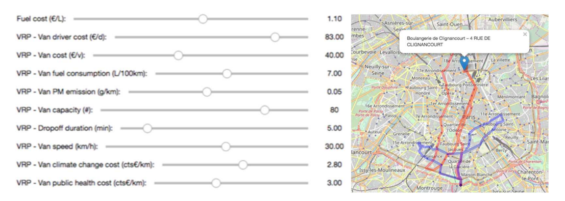
Fig. 2. On the left, simulator parameters are easily customizable using sliders. On the right, vehicles itineraries are plotted on a real map.

Capacity has been directly added as a constraint in the optimization model. The constraint on capacity is viewed as the average number of orders that can fit into one vehicle. A choice of simplicity has been made on this constraint: weight or size of the orders are not considered. This offers flexibility to compare different activities within the same model. Indeed, some companies are limited by order weight (i.e. construction, food industry), while others are limited by order size (i.e. furniture delivery). Moreover, it obviously makes things easier to understand for the users. Anand et al., and Holguín-veras et al. (Anand et al., 2012b; Holguín-Veras et al., 2018) have shown the difficulty to model this constraint as goods can require different types of trucks. Of course, it shades the potential difficulties for companies having orders with different weights (and/or sizes) to optimize their vehicles loading plans. Finer modelling of this constraint could be a potential improvement to study the problem at an operational level in a future iteration.