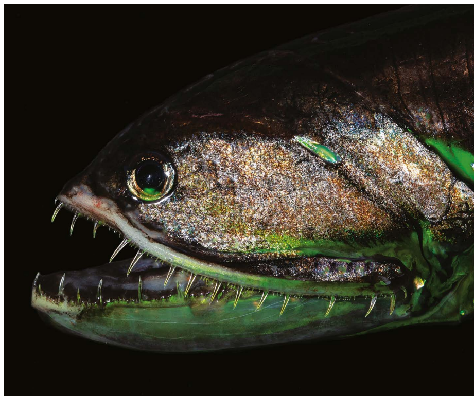
The elongated bristlemouth ( Sigmops elongatus ) is abundant in the oceans' twilight zone.