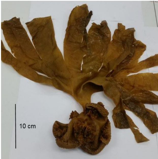
Figure 2. The specimen of Saccorhiza polyschides collected in 2014 at El Aouana (formerly Cavallo), near Jijel, Algeria.