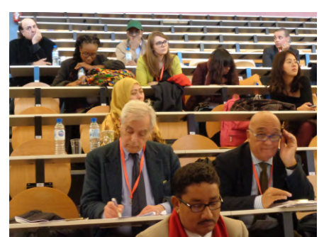
PLENARY SESSION: THE FLOOR