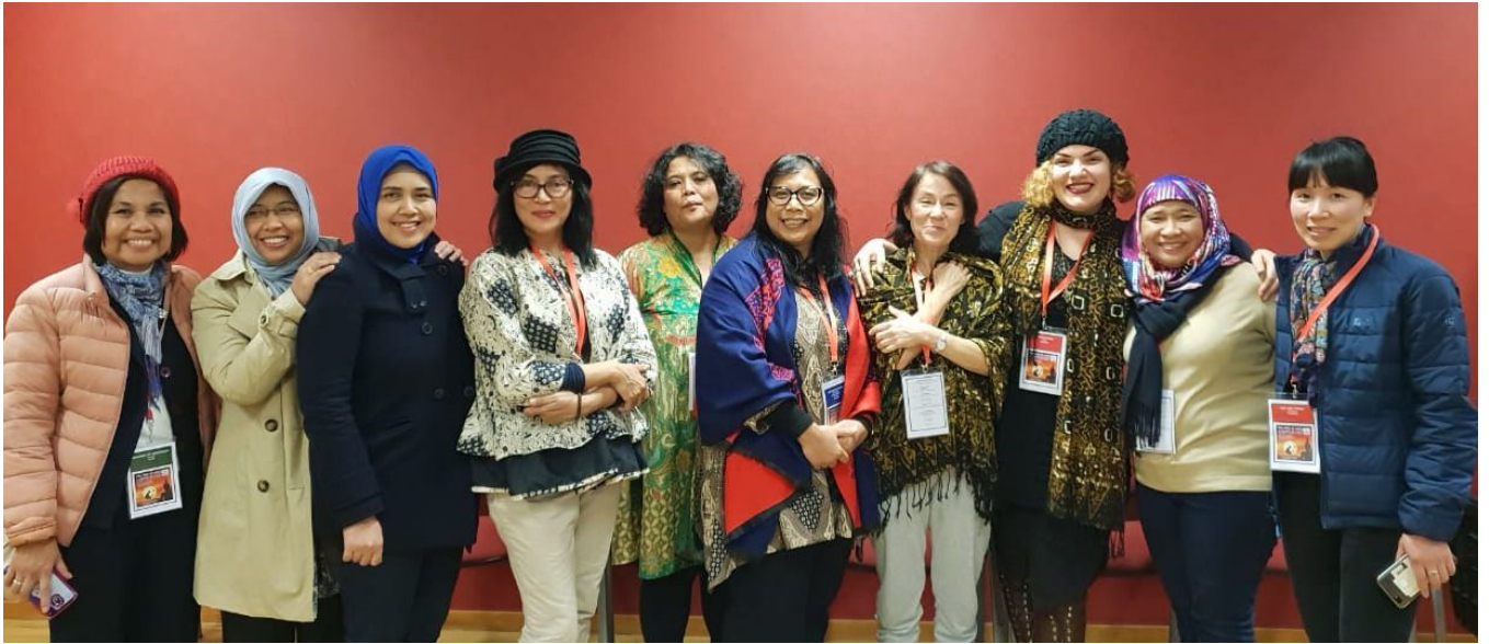
Gender Working Group, Université Le Havre Normandie

Second and third day conference at the University Le Havre Normandie, March 14-15, 2019