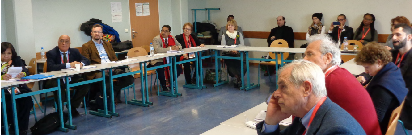
Session BRICS, Université Le Havre Normandie

Second and third day conference at the University Le Havre Normandie, March 14-15, 2019