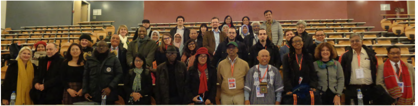
Part of speakers and presenters – Amphi Jules Durand, Université Le Havre Normandie