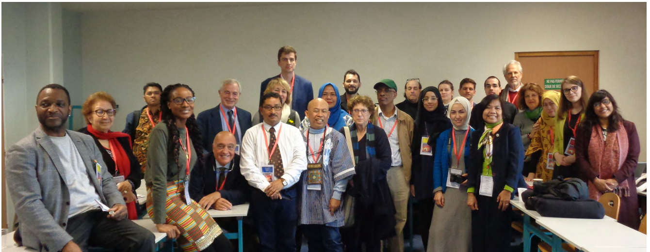
Asia-Africa-BRICS, Université Le Havre Normandie