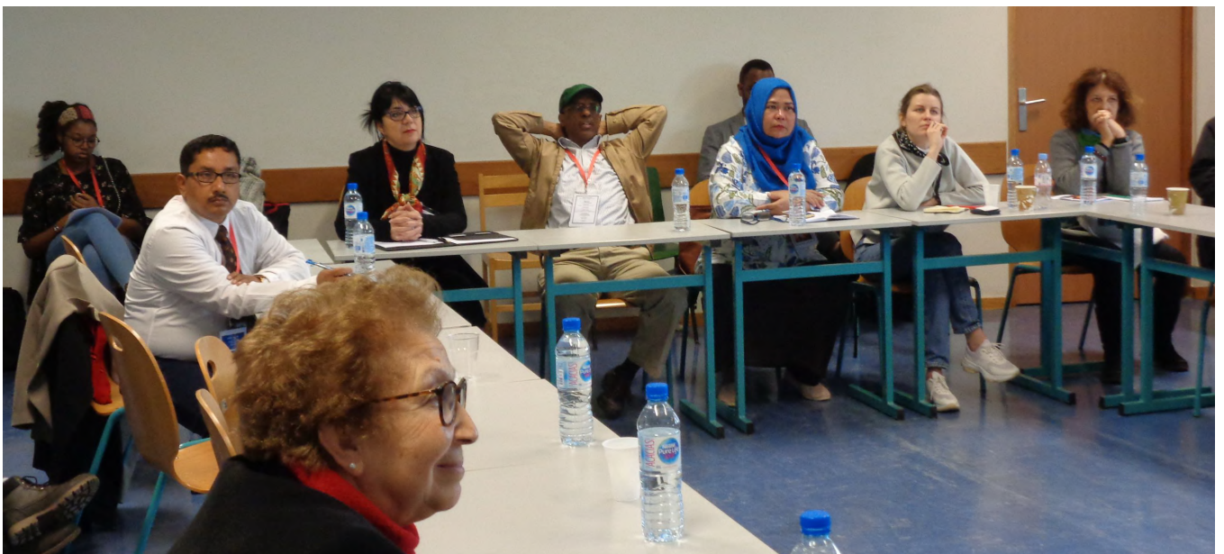
Session Asia-Africa, Université Le Havre Normandie