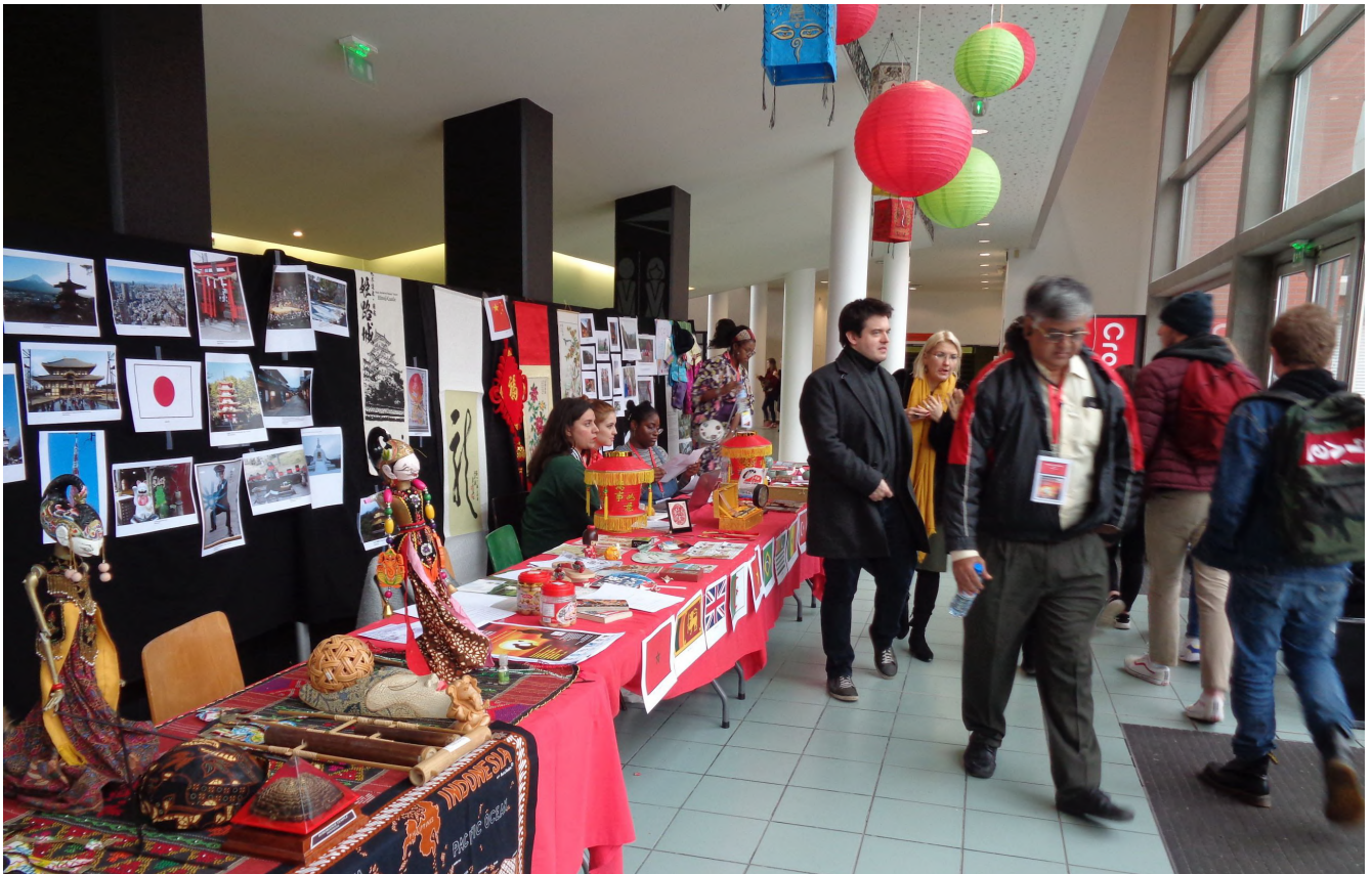
Exhibition ASIA WEEK by Students of Master's Degree in Exchanges with Asia, Université Le Havre Normandie