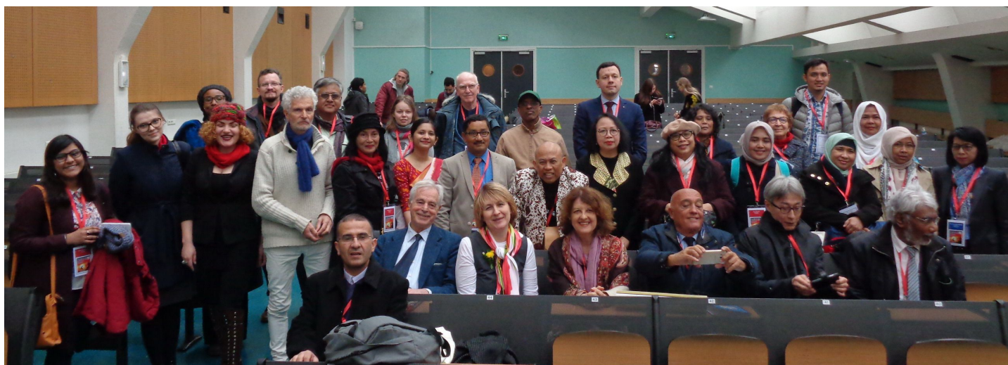
Part of speakers and presenters – Amphi IIA, Université Paris 1 Panthéon-Sorbonne