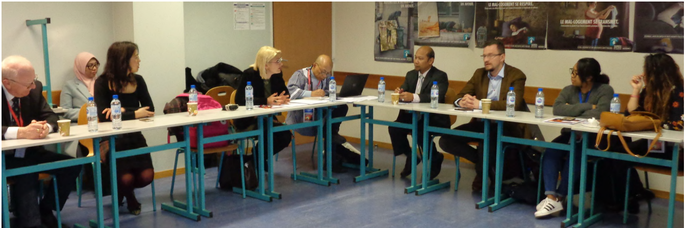
Session Asia-Central & Eastern Europe and Russia, Université Le Havre Normandie