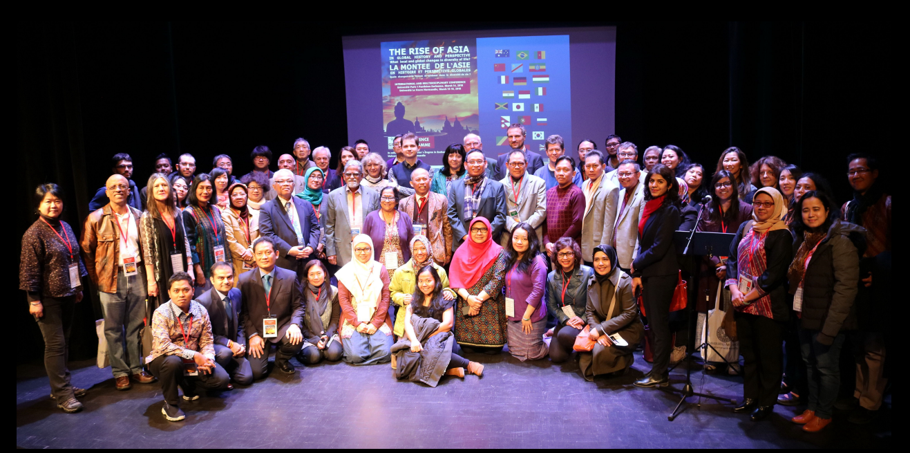
Thursday, March 15, 2018, Université Le Havre Normandie, Amphitheatre Raymond Queneau, "family photo" consisting of most of the speakers