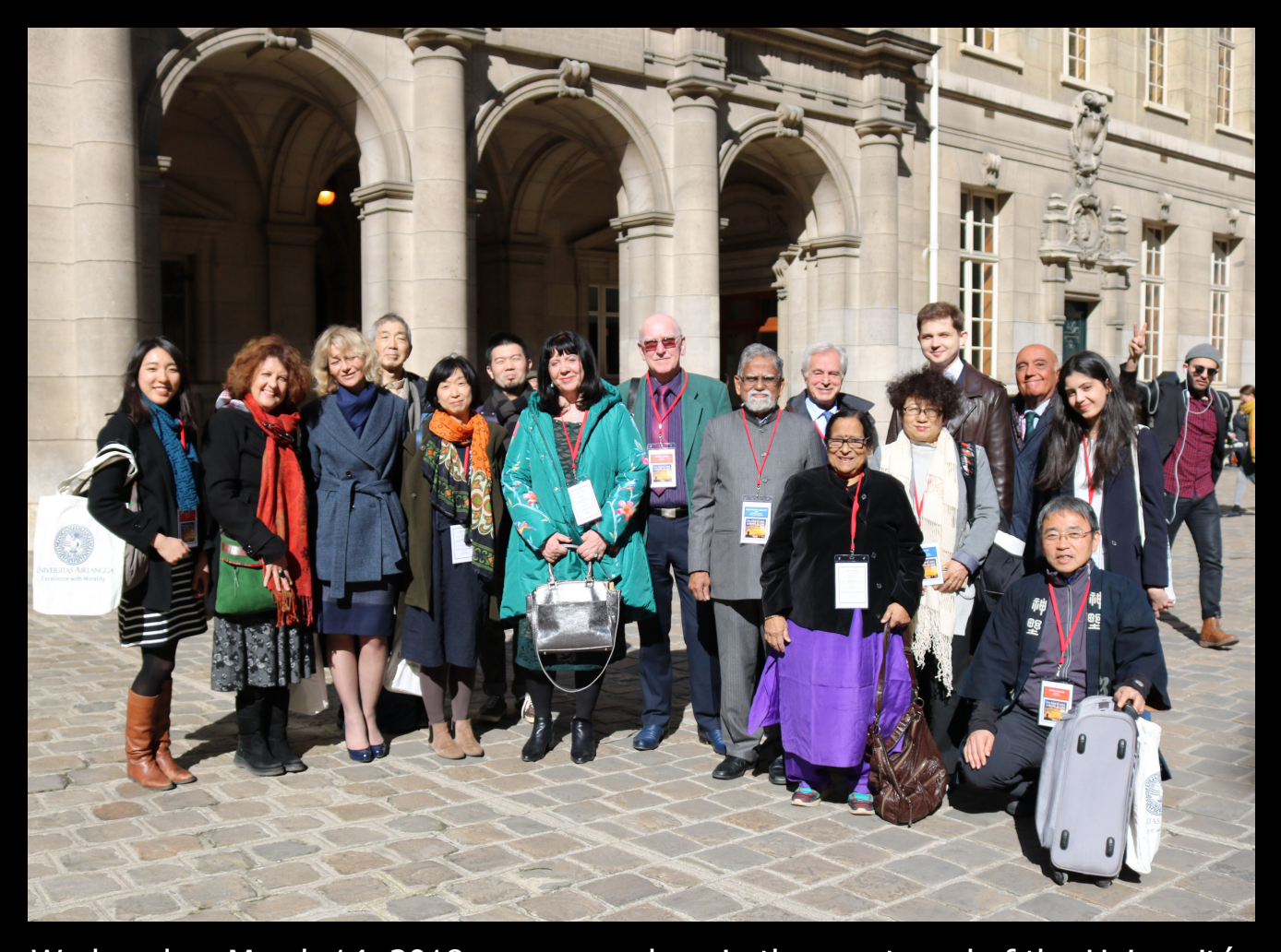
Wednesday, March 14, 2018, some speakers in the court yard of the Université Paris-Sorbonne