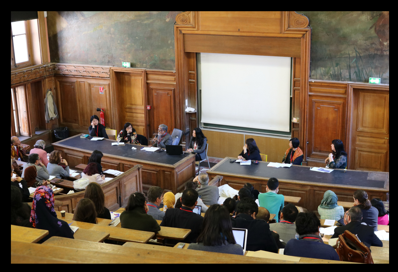
Wednesday, March 14, 2018, Université Paris 1 Panthéon-Sorbonne, Amphitheatre Lefebvre, plenary opening session