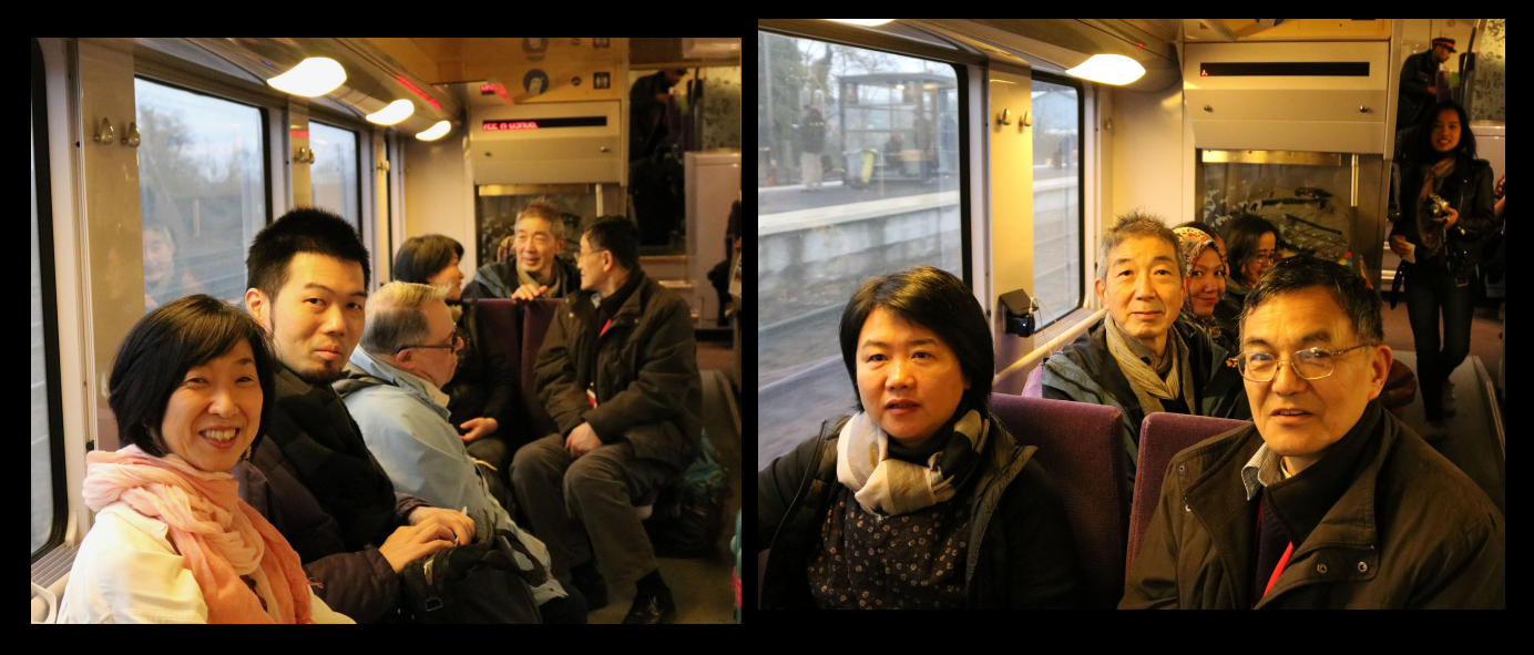
Thursday, March 15, 2018, in the train on the way to Le Havre