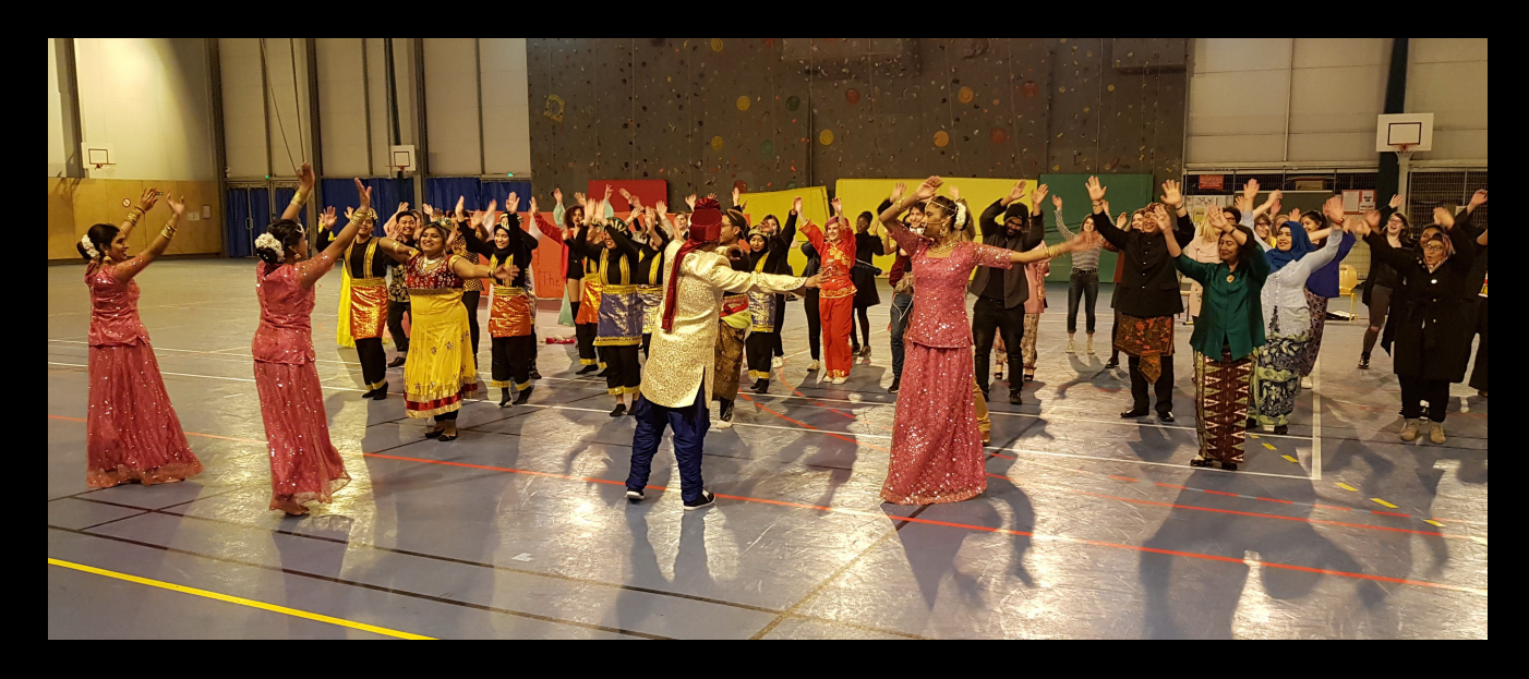
Friday, March 16, 2018, Université Le Havre Normandie, Sport Centre, Sociocultural Evening, Bolywood Dance involving conference participants and students