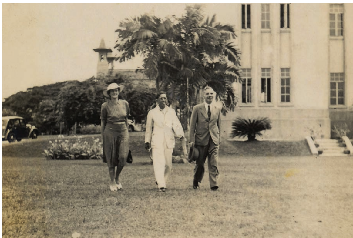
Figure 3 : Lady Gent, Sultan Abdul Aziz of Perak and Sir Edward Gent, Governor of the Union of Malaya, 1948. Both men were MNS members.

ANM 2002/0000580