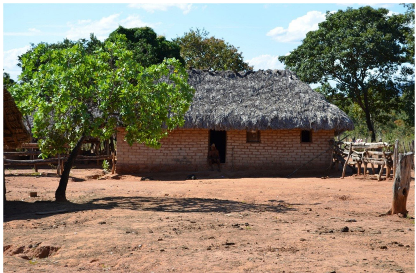
Fig. 1 A typical Kalunga dwelling with adobe (mud brick) house and surrounding subsistence farming area (backyard) in Volta do Canto, Cavalcante. Mr. Casemiro is visible in the center

The semi-structured interviews were applied in a standard way (without replication). This was primarily due to the difficulty of accessing certain areas, such as the remote Chapada dos Veadeiros, in addition to limited financial resources. In this regard, the method bias was overcome through the isotopic composition analysis of subjects’ fingernails, which reflected their dietary habits over a 4- to 6-month period (O’Connell et al. 2001). Food characterization among Kalunga communities was mainly focused on assessing multiple factors associated with changes in the agro-food system. This study aimed to determine (1) the main factors influencing the agro-food system and (2) the isotopic signal of local foods as assessed by fingernail samples collected from community inhabitants.