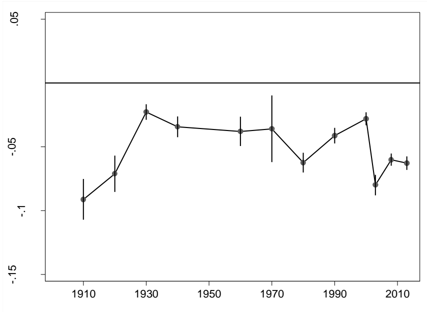
Figure 2: Regression results

Figure notes: the solid line reports the results from the specification in column (3) of Table 2. The vertical lines are 95 percent confidence intervals around the estimates.