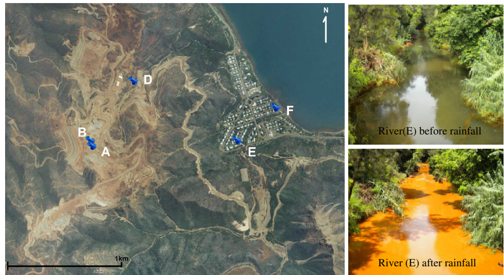
Fig. 1 The mining centre, the village of Poro and location of the five sampling sites at the top of the mining catchment (A, B), at the bottom of the mine (D), in the river (E) and at its mouth (F). Pictures of the river before and after a rainfall show particulate matter run-off

Cr (Cr(III) + Cr(VI)) was measured by atomic absorption spectrometry according to the AFNOR French procedure (NF EN 1233, AFNOR 1996). All reagents were of analytical grade.