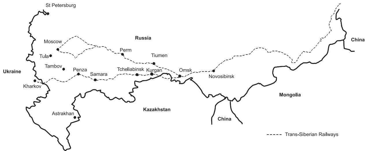
Figure 1. Map showing the trans-Siberian railways.

The first virus entered the EU in October 2004 in two illegally imported Thai Eagles (Van Borm et al. 2005). On 16 September 2005, a similar case occurred. A Pionus Parrot Pionus sp. native to Surinam, kept in quarantine with Mesias Leiothrix sp. officially stated to be from Taiwan, was found dead and declared infected by the virus. It appeared later that Mesias, and not the parrot, were infected by the virus, but the samples had been mixed by the UK authorities (Defra 2005). Nevertheless, Taiwan was free of the virus at this time. Against these detected cases, how many may have been imported and gone unnoticed? Millions of wild birds (Broad et al. 2003), mostly passerines for aviculture, are imported into Europe both legally and illegally from Asia. For example on 20 October 2005, the Taiwanese authorities discovered 1000 exotic birds contaminated by the virus HPAI H5N1 in a container forwarded illegally for China (ProMED 2005b).