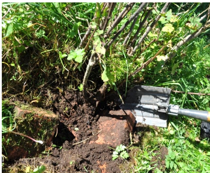
A red currant is retrieved from a pile of bricks - Kamenná Hlava near Volary, 920m. To reproduce it, only a division of the mother plant (or colony) is usually taken, which still survives in its place of origin.

Prospecting the cultural relics of the vanished villages was the subject of an initial article "Reviving the Sudeten plant heritage" (KISSLING 2012). Many villages, hundreds of hamlets and thousands of isolated houses remained empty after the expulsion of the German-speakers in 1946 ( https://www.zanikleobce.cz ). In the abandoned gardens, invaded by nettles and goat willow, not only have fruit trees and herbaceous plants such as dame's violet, sweet williams, orange lilies, monkshood, various mints, lilac and some rose bushes survived, but so too have red currants, black currants and gooseberries. They represent the pre-war range of plants and may be hiding some treasures.