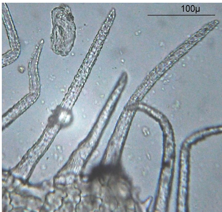
Under the microscope, the unmistakable verrucous cilia at the margin of a sepal of a wild Ribes petraeum (Swiss Alps)

EDWARD JANCZEWSKI, director of the Botanic Garden of Krakow, wrote the botanical monograph on the genus Ribes in French, which was published in Geneva in 1907. He would no doubt have reasoned as follows: “You can see for yourself under the magnifying glass that the calyx of red currant X is ciliate like those of ‘Prince Albert’ and ‘Gondouin Red’; these cilia and the red of the flower, they come from its wild parent Ribes petraeum ”. A century later, a molecular geneticist may one day declare that “the unknown X has many different alleles of different loci in its DNA in common with petraeum ”. It is just that – as for