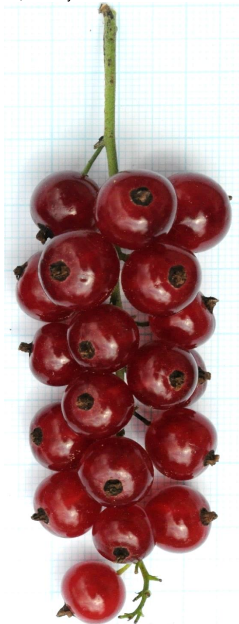
‘Gabreta’: the deepest coloured and most acid of the red currants. But with enough sugar, its jelly is delicious