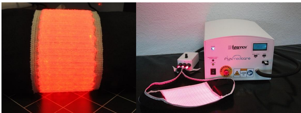
Figure 1. Light emitting fabric sample coupled to 635 nm LASER source (left) and FLUXMEDICARE® device (right)

Developed in the framework of CIP PHOS-ISTOS European project, light emitting fabrics (LEF) technology consists in the integration of step index optical fibers (TORAY, Tokyo, JAPAN) with a polymethyl methacrylate (PMMA) core and a fluorinated cladding within a fabric structure during the knitting process. Controlling macrobendings and yarn tension during the knitting process, homogeneous light emission over the entire surface of the sample can be obtained. Produced in one step by warp knitting technology, LEF are made of polyester yarn and embed 37 POF/cm 2 and can have an effective area over 500 cm 2 while keeping flexible and conformable properties. [27, 28]