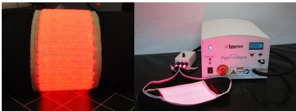
Figure 1. Light emitting fabric sample coupled to 635 nm LASER source (left) and FLUXMEDICARE® device (right)

Developed in the framework of CIP PHOS-ISTOS European project, light emitting fabrics (LEF) technology consists in the integration of step index optical fibers (TORAY, Tokyo, JAPAN) with a polymethyl methacrylate (PMMA) core and a fluorinated cladding within a fabric structure during the knitting process. Controlling macrobendings and yarn tension during the knitting process, homogeneous light emission over the entire surface of the sample can be obtained. Produced in one step by warp knitting technology, LEF are made of polyester yarn and embed 37 POF/cm 2 and can have an effective area over 500 cm 2 while keeping flexible and conformable properties. [27, 28]