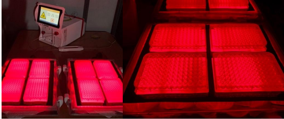
Figure 2. Light plates connected to 670 nm LASER source without black covers

To our in-vitro PDT preclinical studies, two light plates have been designed. Each light plate embeds 600 cm 2 of LEF allowing the simultaneous illumination of up to four 96-cells plates. Transparent plastic sheets provide hygienic barrier and water protection to light emitting fabrics, and can be cleaned and disinfected before/after each use. Lightproof black covers allow the operator to stay in the room by preventing additional activation of the PS with stray light and prevent internal light reflection that can lead to inconsistent dosing.