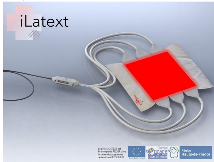
Figure 1 PAGETEX® device

diffused illumination for photodynamic therapy, and is a class IIa medical device in the European Medical Device Classification System (93/42/EEC).