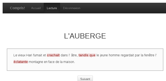
Figure 2: The web interface used to collect the learner annotations. The words that are unknown to a given learner are highlighted in red.