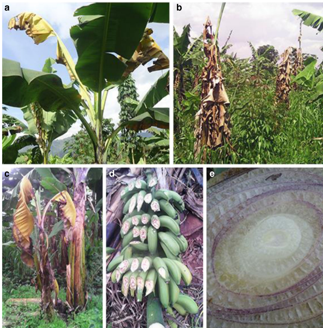
Fig. 3 Symptoms of banana Xanthomonas wilt are a yellowing of the leaves, b wilting of the whole plant, c symptomatic banana sucker, d cross-sections of the banana fingers showing rusty brown stains, e yellow bacterial ooze from a cut pseudostem

The interviews were face to face with the farmers and were performed in the local language (Kinyarwanda). The questionnaire included both open and closed questions. Closed questions included questions about farming practices, applied disease management practices, and the source of acquired knowledge on Xanthomonas wilt. Open questions included farmers' knowledge on disease detection, spread, and management. To assess the source of knowledge about the disease,