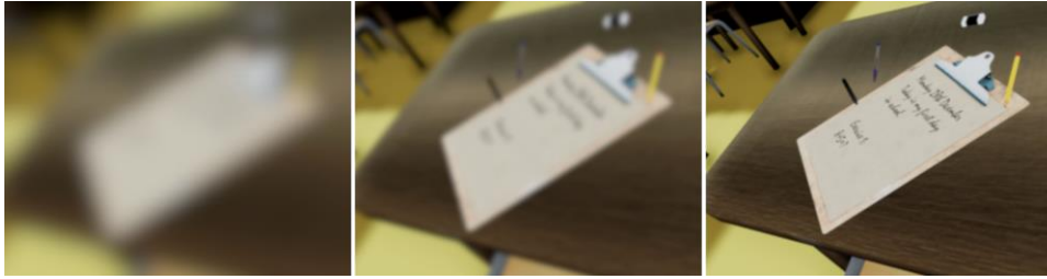
Figure 2. The continuum of visual impairment (acuity). On the left, only a clipboard is identified. The second picture reveals one yellow pencil, a back pencil and the text. The text is readable in the last picture as well as a third blue pen. While the acuity is affected by blurred vision [7], knowledge of the environment helps. Looking back to the left, note that, once you know an object exist, it becomes easier to “see” or “guess” where it is. This demonstrates that perception of the same scene can vary.

loss suffered at these locations. However, there is evidence that individuals with a central scotoma may experience auto-completion, a phenomenon where the cognitive system extrapolates visual information from the surrounding area into a blind spot [6]. Thus, a loss of central vision may not always be obvious. Similarly, in tunnel vision the vision loss in the periphery may not be experienced as a black area surrounding the functional field of view. The phenomenological experience is rather akin to how fully sighted people visually perceive space outside their field of view (e.g., space behind their heads)—namely, not as a black field but rather there is no visual experience at all.