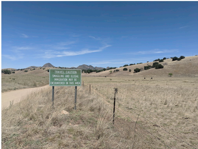
Fig. 2. Using the three axes to situate SPR among other types of landscapes and geographical environments.

governance projected by the metropolises today tends to insist more and more on the protection of the environment, leading to other forms of impositions as exemplified by the creation of protected areas. With global efforts to mitigate climate change, SPR will probably be impacted by even more regulations since they seem “empty” in the eyes of most governments (cf. the aforementioned “terra nullius” doctrine), meaning that the political cost of such a move is low or negligible at the national level. Conflicts will probably increasingly appear as these areas are summoned to follow ecological guidelines and their population nurtures a growing feeling of “territorial dispossession” or telistokome as Laslaz (2005) points out in the case of the farmers surrounding the French Vanoise national park. Such conflicts might also appear with Indigenous peoples when their practices are considered “unecological” by the center of power, leading to eviction from their territories or restriction of their activities, in a “good guy vs good guy” fight as depicted by Dowie (2009). Given the conservation value of indigenous lands across the world (Garnett et al., 2018), it is vital to avoid such conflicts and to take into account indigenous voices in defining the governance of their lands (Brondizio and Le Tourneau, 2016). The same can be said for lands under customary rights, which are a crucial in many places and especially in Africa. 8