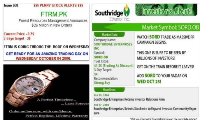
Fig. 1. Sample spam images.

Spam from emails was initially in the form of text. Several Machine learning (ML) based spam detectors are developed for classification. ML models like Support Vector Machines (SVM), K-Nearest Neighbors (KNN), Naïve Bayes (NB), etc. are used for filtering email spam with 95% accuracy in [9]. Over time, the attackers came up with new ways like Image spam which is shown in the Fig. 1 to trick the existing spam filters. Image spam attack contains images with text embedded to it and they are used by attackers to evade text-based spam filters. These images trick the user to click on it which might cause redirection to unsafe websites or causes malware infection.