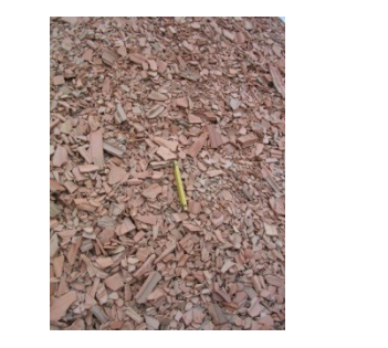
Brick (0-40 mm)