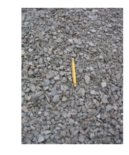
Track ballast (0-40 mm)