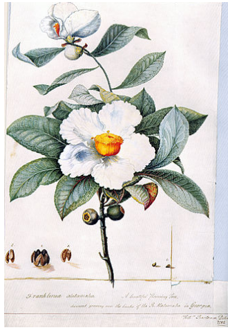
Dessin de Franklinia Alatomaha (Arbre de Franklin). William Bartram, Travels .