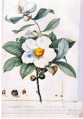
Dessin de Franklinia Alatomaha (Arbre de Frankin). William Bartram, Travels .