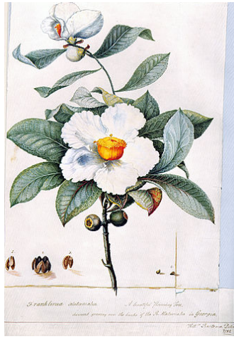
Dessin de Franklinia Alatomaha (Arbre de Frankin). William Bartram, Travels .