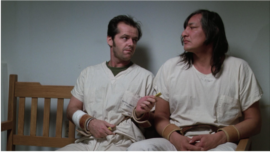
Fig. 3: “Chief” Bromden is about to “open up” to McMurphy, No traditional garb or stereotypical headdress here: their identical attire puts them on an equal footing.