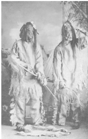
Fig. 1: Dakota heyoka dancers (photograph by Frank Fiske, Fort Yates, north Dakota, featured in Howard).

Comic relief seems to be a crucial function offered by some Indian sidekicks in Hollywood, a function that is arguably related to a traditional Native American character, the heyoka (among the Sioux and some other Plains tribes), or even the trickster in other tribes. According to anthropologist James Howard, “The heyoka cult is made up of individuals who [...] are obliged to assume the role of antinatural clowns.” 24 At least in the twentieth century, the heyoka assumed a sacred function of parody and satire: white people or drunkards, for example, were mocked, presumably to highlight, and confront them with, their flaws or problematic attitudes. According to anthropologist Thomas Lewis, mockery, in Oglala society, is a way to discourage deviant behaviors and promote conformity.