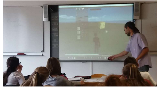
Figure 1: Math teacher explaining volume building in the VW

The virtual is no longer experienced as an experience in itself, because it is based on the frame of social meanings in which each individual is able to place it. It is in this sense that the VW can be considered experiential, in which the perceptual component (visual, tactile, kinesthetic) merges with interactivity. The VW thus conceived becomes a communicative tool which acts not only among users but also between them and the environment in which they are immersed. It enables imaginary building through situated learning.