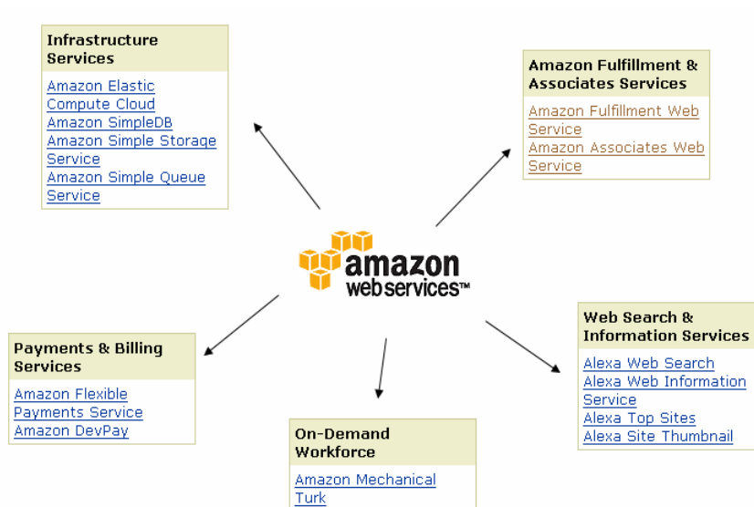
Figure 2: Amazon Web services

Amazon can offer retailers a complete, turnkey e-commerce service (Amazon WebStore), or any part of that service: access to Amazon's 76 million active customers, the Web front end for online buying and other customer activities, order fulfillment (packaging and shipping), payment service (Amazon FPS) and customer service for e-mail and phone inquiries (Amazon TextBuyIt). With such services, partners only pay for what they use. For Amazon, these eServices are an opportunity to build a real value network sharing the corporate “crown jewels”, that is its ICT infrastructure. Thanks to this initiative, Amazon’s platform clearly stands out as a dominant design or a de facto standard in e-Business. However, the impact of Web services is not only limited to the syndication of content and the creation of a network of partners. Opening up its platform has also enabled Amazon to tap into new value deposits: the innovative applications dreamed up by external developers. Today, these applications have vastly increased Amazon's reach.