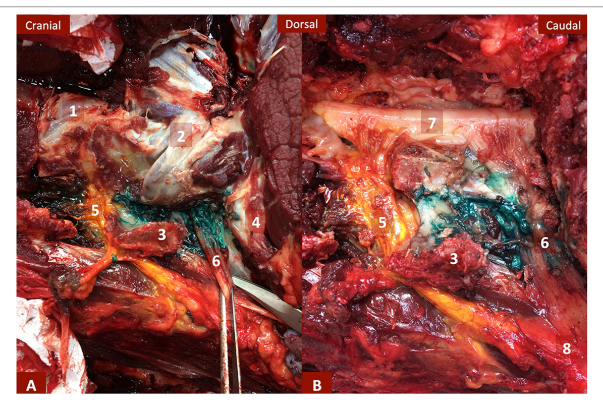
FIGURE 3 | (A,B) Dissection of the left C7 and C8 ramus ventralis of horse 4 after removal of the neck muscles (A) and after opening of the vertebral canal (B). C7 has an extensive yellow staining reaching the epidural space and the meninges and spreading to the limit of the brachial plexus. C8 green dye spread is delimited to the ventral aspect of the articular processes with dye diffusing dorsally to C7 transverse process. 1- Caudal articular process of C6 and cranial articular process of C7; 2- Caudal articular process of C7 and cranial articular process of T1; 3- Transverse process of C7; 4- First rib; 5- Ramus ventralis of C7; 6- Ramus ventralis of C8; 7- Spinal cord covered by the meninges; 8- Brachial plexus.

be nerve selective regarding their proximal diffusion in the vertebral canal.