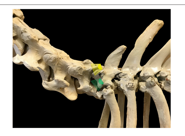
FIGURE 1 | Ultrasound probe positioning and orientation to visualize C8 ramus ventralis in a longitudinal section in horses. The probe is initially oriented perpendicular to the vertebral axis to obtain a reference image of the 2 articular processes and the joint space (yellow scan field) then glided ventro-caudally with an approximate 20° angle from its initial position (counter-clockwise rotation on the left side of the neck, green scan field).