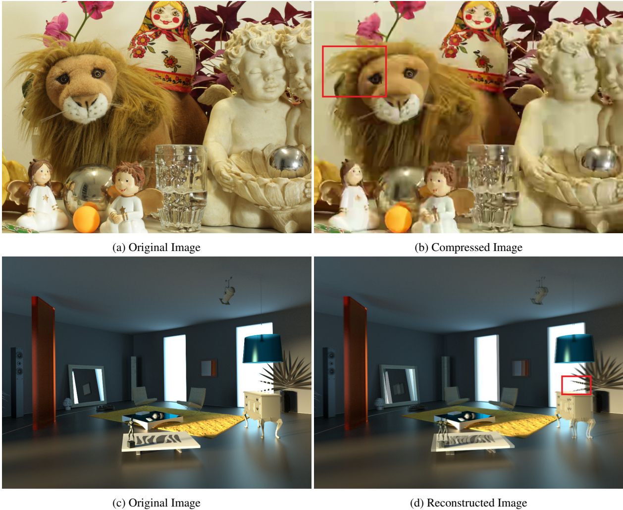
Figure 2: Distortion due to compression and reconstruction algorithms

formance. The large amount of LF images captured with Lytro camera enables the training of deep learning schemes.