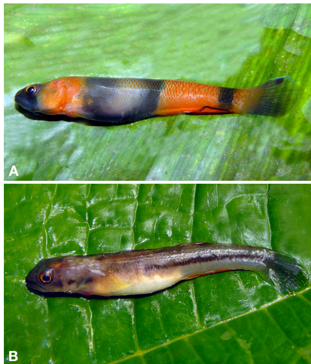
Figure 1. – Sicyopus beremeensis . A: Male (49 mm); B: Female (45 mm).

Paratypes . – MNHN 2016-0629, 1 male, 1 female (45-48.6 mm SL). Same data as holotype. MNHN 2018-0717, 1 male (47 mm SL), Elnge Creek, New Britain (Papua New Guinea), 12 Nov. 2015, Amick et al. coll. MNHN 2018-0718, 5 males, 2 females (39-57 mm SL), Kumkom Creek, New Britain (Papua New Guinea), 13-17 Nov. 2015, Amick et al. coll.