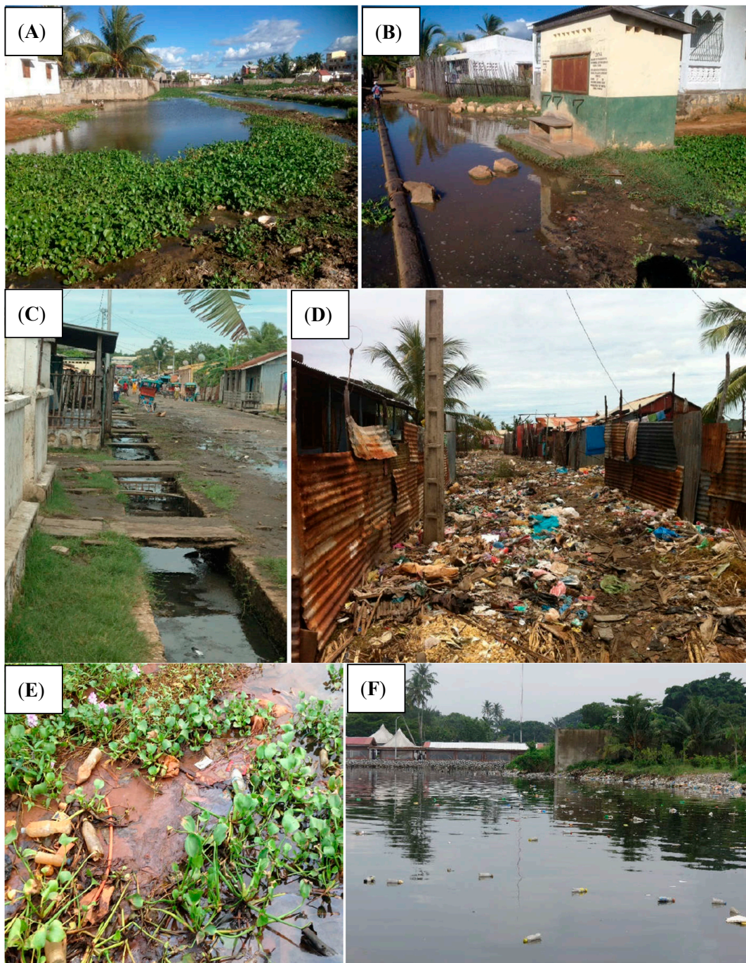
Figure 1. Plastics and garbage in an open sewer network; (A–D) Mahajanga, Madagascar, 2014, (A,B) open sewer network, (C) standpipe in a flooded area, (D) garbage pen in an area liable to flooding; (E,F) Ébrié Lagoon in Abidjan, floating plastics.