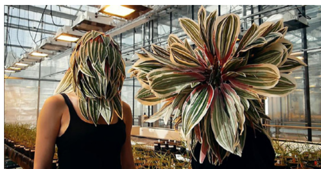
Figure 8: Communication. Original title: Extrait du film Devenir- plante (manger la terre), 2017.

During the Tokyo Olympic Games in July 2020. Just sign here: