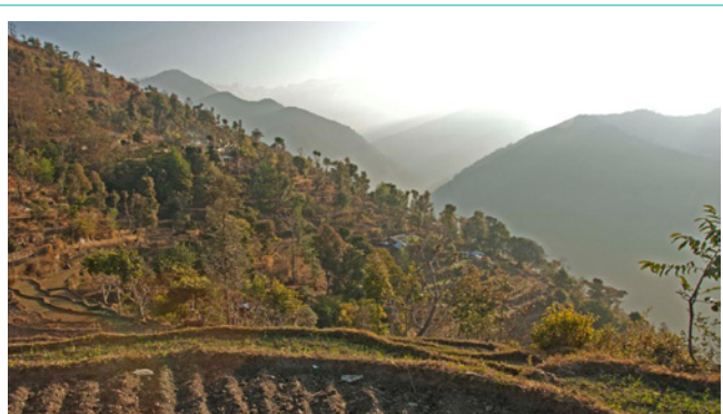
Figure 4: An agrosilvipastoral system in the Gaurishankar Conservation Area, Nepal. On farm trees provide fuelwood and fodder for cattle and mitigate the pressure on forest resources.

ensure ‘sustained’ food production. There are, however, ‘carrying capacities’ of the landscape. In our research area, the locally, mainly organically produced, food supply lasts for approximately 4-6 months, the rest is ‘filled up’ with rice and lentils imported from India, probably produced in an industrial way. Still, traditional land-use practices lead to severe degradation of forests.