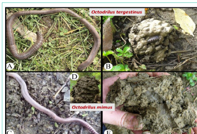
Figure 6: In a paper on agriculture we could not miss the engineering animals that create the chemical, physical and biological characteristics of the most productive soils in Europe. A and B Octodrilus tergestinus , adult specimen and new soil generated by the animal respectively; C, D and E Octodrilus mimus , adult, generated soil and a detail of its gallery. They are animals capable of incorporating organic substance and micro-organisms deep into agricultural soils over 1-2 meters.

The food of a well-conducted organic farming is with all probability better and has the advantage of promoting greater