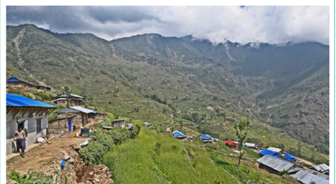
Figure 3: A hillfarming community in Nepal. Forests are degraded as a consequence of overutilization for agricultural purposes (cattle grazing, lopping of trees for fodder and fuelwood, litter raking (litter is used as animal bedding and the compost, mixed with urine and faeces is finally applied as a fertilizer to arable land)).

Can we escape such traps? An example of land use and land-use change from one of the regions where I study human-landscape interactions (Figure 3&4): Mountain hill farming in the Himalayas functions as long as there are systems surrounding farm fields, which can be ‘tapped’ for nutrients. 1 ha of arable land needs 2-5 ha of the forest as a nutrient source, be it exploited by grazing, lopping of trees or litter raking, the nutrients end up at the agricultural fields and