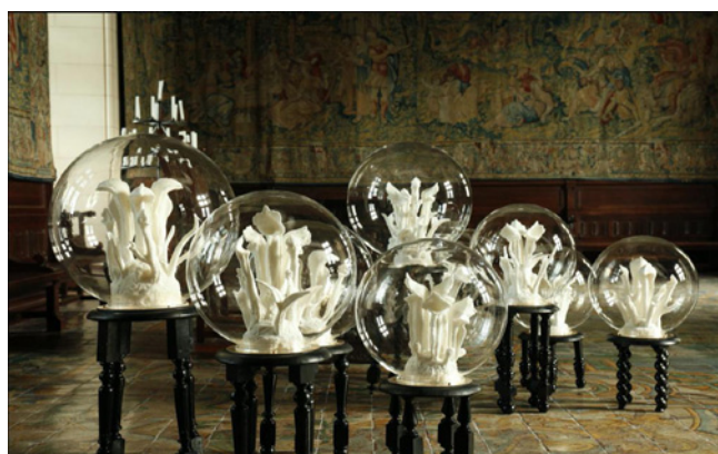
Figure 7: Confined ecosystems.