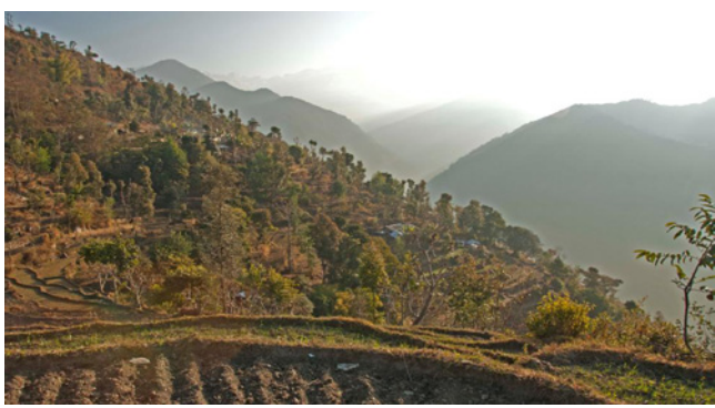
Figure 4: An agrosilvipastoral system in the Gaurishankar Conservation Area, Nepal. On farm trees provide fuelwood and fodder for cattle and mitigate the pressure on forest resources.

ensure ‘sustained’ food production. There are, however, ‘carrying capacities’ of the landscape. In our research area, the locally, mainly organically produced, food supply lasts for approximately 4-6 months, the rest is ‘filled up’ with rice and lentils imported from India, probably produced in an industrial way. Still, traditional land-use practices lead to severe degradation of forests.