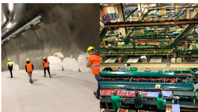
Figure 2: Val di Non. Left: after harvest, the apples are stored in the heart of the mountain, in cold rooms with a controlled atmosphere to preserve them for a long time and be sold at the right moment. The rock isolates the gas chambers and it has been calculated that the investment will be paid for with the energy savings achieved. The cooperatives provide jobs to local people on an ongoing basis. Instead, very tight work shifts are organized, and seasonal personnel is called to work from many parts of the world, at the time of the apple picking. The climate response of the valley has been studied and the harvest follows the ripening of the apples with cycles of a few days per band, predefined by specialized personnel. Right: automated preparation of apple loads to be exported throughout the world.