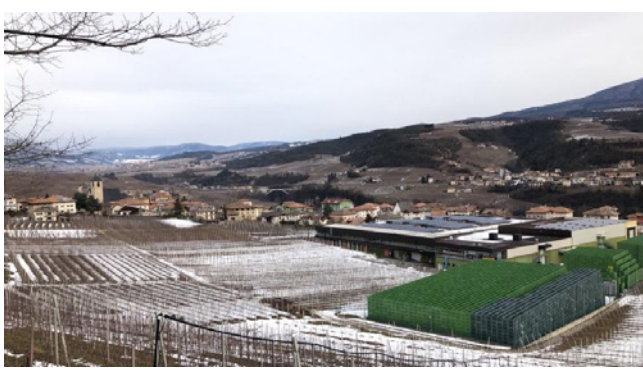
Figure 1: Tassullo, a village of 800 inhabitants in Val di Non. The hardworking people of the valley transformed the environment in which they live by keeping up with science. The beige parts are orchards in the winter season, planted higher and higher instead of the forest. In the foreground on the right is an apple cooperative deposit. In the village, the pace of work follows that of the phases of apple production.