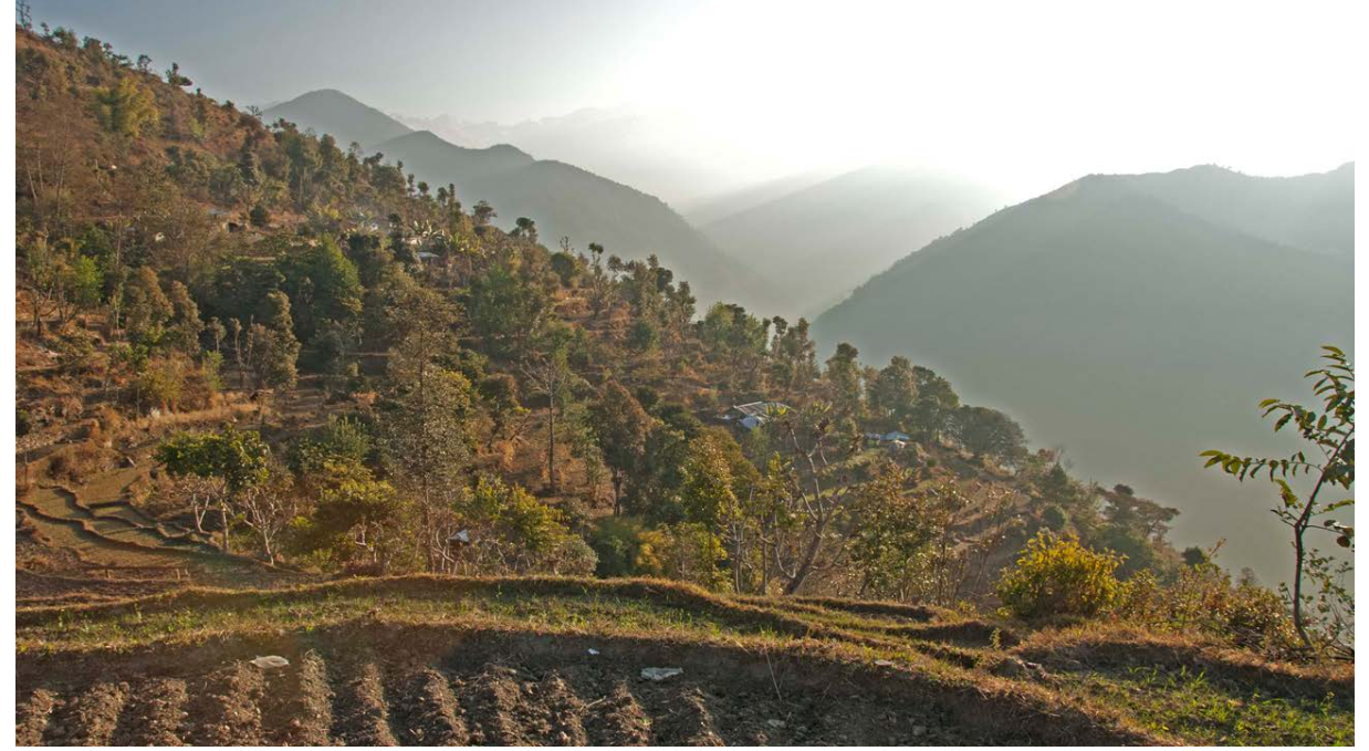
Figue 4. An agrosilvipastoral system in the Gaurishankar Conservation Area, Nepal. On farm trees provide fuelwood and fodder for cattle and mitigate the pressure on forest resources.