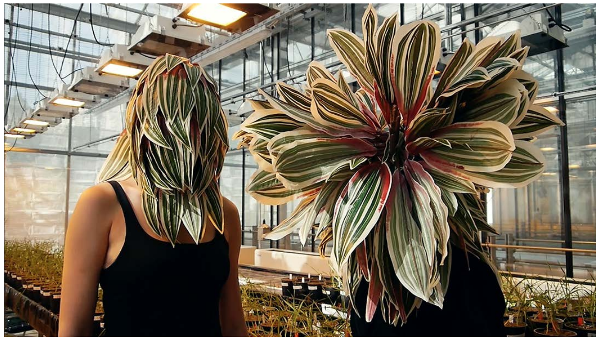
Figure 8. Communication. Original title: Extrait du film Devenir-plante (manger la terre), 2017.

The second illustrates a human attempt to become "vegetable", at least partially. Such an attitude makes humans lose face.