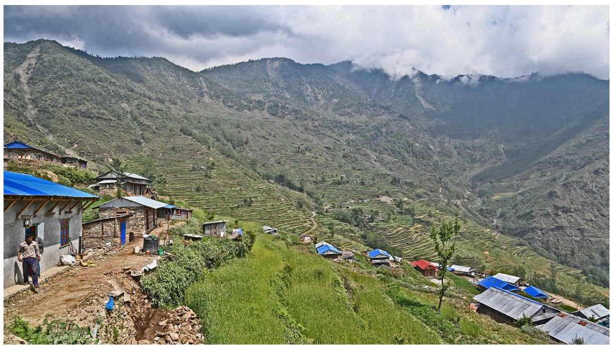
Figure 3. A hillfarming community in Nepal. Forests are degraded as a consequence of overutilization for agricultural purposes (cattle grazing, lopping of trees for fodder and fuelwood, litter raking (litter is used as animal bedding and the compost, mixed with urine and faeces is finally applied as a fertilizer to arable land).

We support community forestry, establishment of trees on farm boundaries and agroforestry in two remote communities within a carbon offset project. Participation is the key. Farmers and researchers from Nepal and from Europe learn from each other. In the end, decisions are taken by the communities! There is no single solution 'organic', 'dynamic', 'agroforestry', 'conventional', we try to practice 'adaptive management', carefully monitoring effects of our interventions.