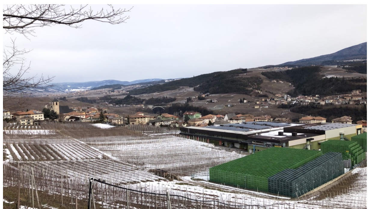
Fig. 1. Tassullo, a village of 800 inhabitants in Val di Non. The hardworking people of the valley transformed the environment in which they live by keeping up with science. The beige parts are orchards in the winter season, planted higher and higher instead of the forest. In the foreground on the right is an apple cooperative deposit. In the village, the pace of work follows that of the phases of apple production.