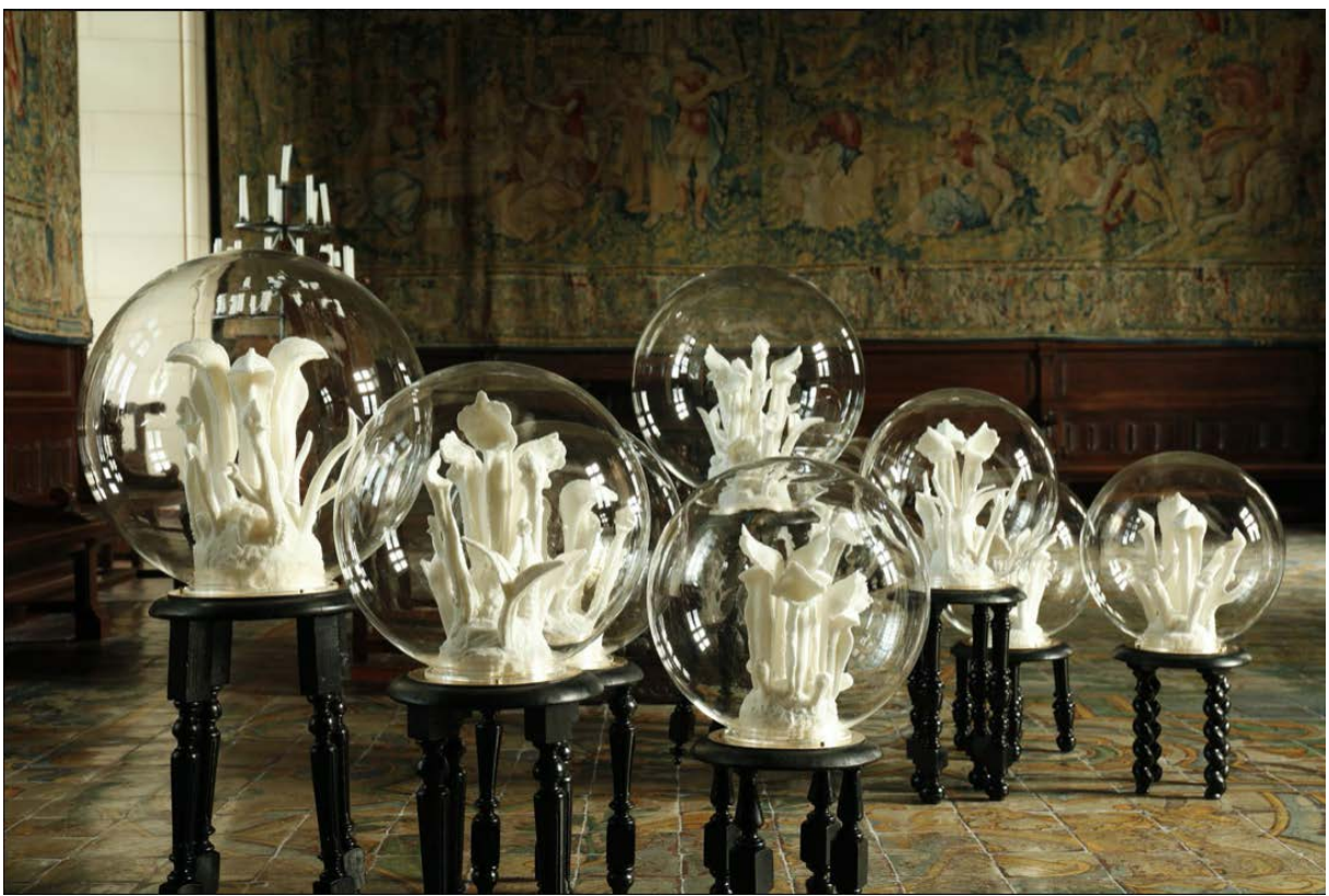
Figure 7. Confined ecosystems.

The second illustrates a human attempt to become "vegetable", at least partially. Such an attitude makes humans lose face.