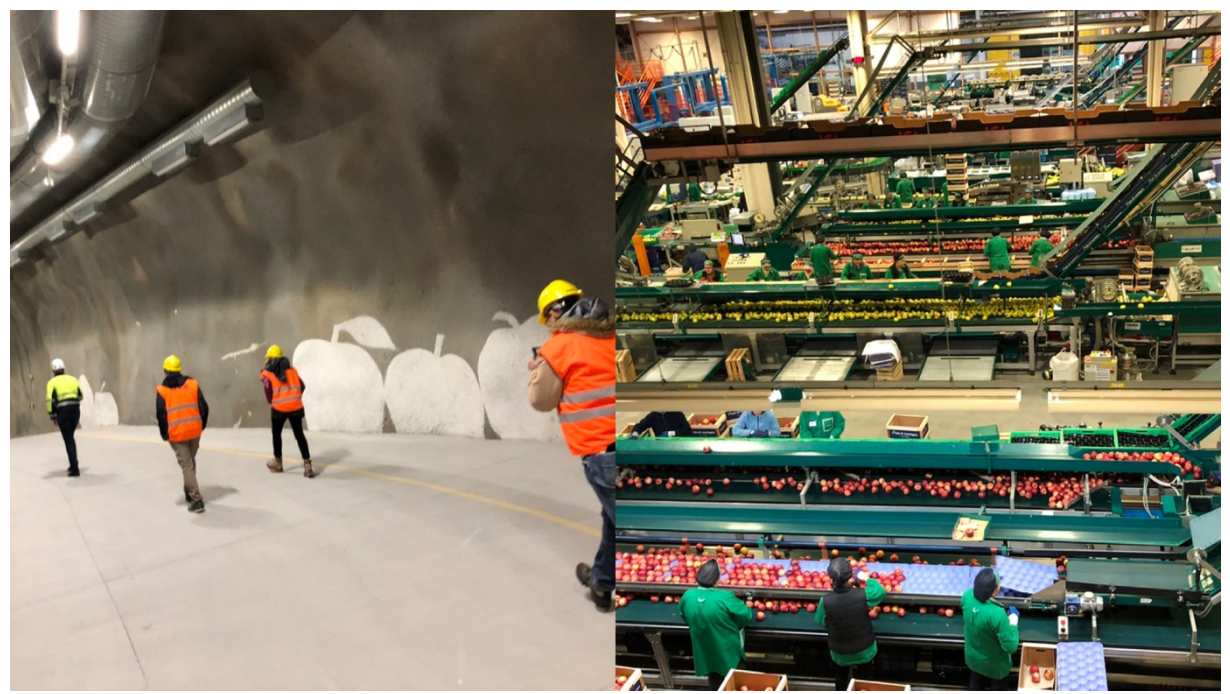
Figure 2. Val di Non. Left: after harvest, the apples are stored in the heart of the mountain, in cold rooms with a controlled atmosphere to preserve them for a long time and be sold at the right moment. The rock isolates the gas chambers and it has been calculated that the investment will be paid for with the energy savings achieved. The cooperatives provide jobs to local people on an ongoing basis. Instead, very tight work shifts are organized, and seasonal personnel is called to work from many parts of the world, at the time of the apple picking. The climate response of the valley has been studied and the harvest follows the ripening of the apples with cycles of a few days per band,