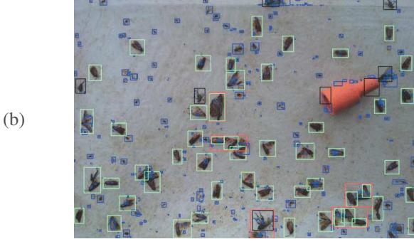
Fig. 1. An example of (a) an input image and the elements to classify, and then, (b) the classification result obtained. (a) contains the insects of interest, i.e., Lobesia Botrana, Eudemis , a European wine moth (inside the green circle). Unfortunately, it also contains some difficulties that we generally called noise, i.e., pheromone cap, herbs and small insects (blue circles). Finally, some of the insects of interest are too close to be separated (red circle), i.e. they are touching, and this problem has to be taken into account. (b) contains the detected noise (blue rectangle), possible touching insects (red rectangle), Eudemis (green rectangle) and other insects (black rectangle).

For insect recognition/classification, many methods have been applied to butterfly classification, like [11], [12] but few publications are dedicated to agricultural insects. We can consider two different possibilities for doing this task. On one side, methods have considered insect specimens [11], [13] where images contain few difficulties and are at high resolution. In this case, classification can be applied directly without the need of a segmentation step [14]. On the other side, in wild trap images, two steps are needed: a first insect segmentation before applying a classification approach in a second part. These methods encounter many challenges: low