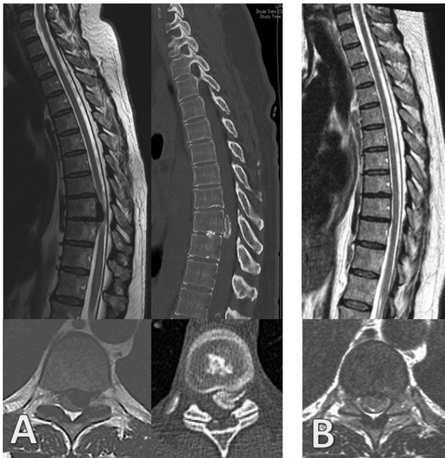
Fig. 1. A 51-year-old patient who complained of left-sided intercostal neuralgia secondary to coughing effort. Two and a half months after the onset, she presented neuropathic pain in the left lower limb. No neurologic deficit was found on the day of the consultation. The somesthetic evoked potentials were discretely slowed down; the evoked motor potentials were normal. The CT scan and T2-weighted MRI found a calcified T9-T10 thoracic disc herniation of ascending path (A). The decision taken was supervision. At 8 months, the pain disappeared and MRI confirmed the resorption of the lesion (B). The electrophysiological assessment was unchanged.

All the patients were seen in consultation and examined by the same practitioner with expertise in the management of these pathologies. The initial diagnosis of TDH was based on a vertebro-medullary MRI and a computed tomography (CT) scan. When there was no evidence of medullary dysfunction, an electrophysiological examination (Somatosensory and Motor Evoked Potentials) was performed in search of subclinical myelopathy. In case of minimal abnormality, the management consisted of clinical,