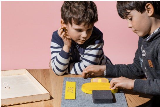
Figure 3: Scenario of Learning Matter - in this case children interact with e-textile to express their emotions