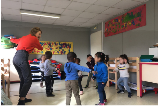
Figure 2 : Scenario of an Interactive Story performed in a kindergarten in Paris with children from 3 to 6 years old