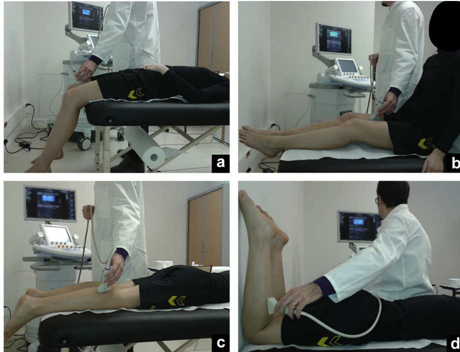
Fig. 2. Measurement positions of shear modulus in rested and stretched muscles of the thigh and calf. BF = biceps femoris; GL = gastrocnemius lateralis; GM = gastrocnemius medialis; GRA = gracilis; RF = rectus femoris; SAR = sartorius; SM = semimembranosus; SOL = soleus; ST = semitendinosus; VL = vastus lateralis; VM = vastus medialis.