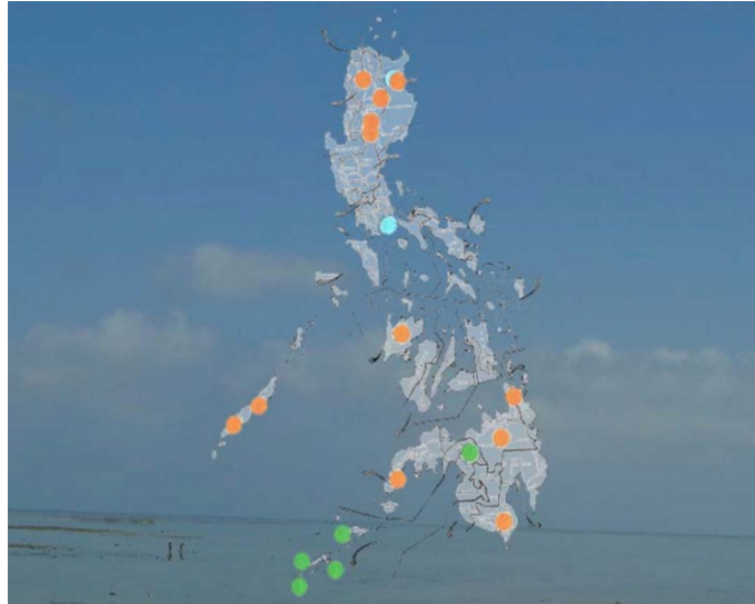
Fig. 2. Map of the Philippine Archipelago, with locations of epic collection indicated (red: animists groups; green: Islamicized groups; blue: Christianized groups).

familiar to me as a linguist-anthropologist, the Philippines. 5 In 1991 the collection began with collaboration among 25 Filipino scholars and other knowledgeable locals, and with the financial support of the Ministry of Foreign Affairs of France and the French Embassy in Manila (including four grants per year over the entire ten-year period) we were able to preserve the voices and beauty of verbal art forms from 15 different cultural communities. 6 This preservation process involved audiotapes, audio-video tapes, photographs, and computer storage of manuscripts in the various source languages and in English, Tagalog, and/or French translations. However, we have not yet been able to fully cover the multiplicity of languages and cultures present in this complex archipelago, and much work still remains to be done in order to preserve the memory of the many songs that still survive. It is my hope that the multimedia archive we have initiated will be enriched by the younger generation of scholars and other individuals from the Philippines or abroad.