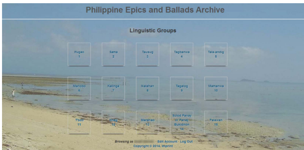
Fig. 3. Screenshot ( http://epics.ateneo.edu/epics/linguistic_groups ) illustrating the overall arrangement of the Phillipine Epics and Ballads Archive.

Since January 2011 a special server at the Rizal Library has provided free access to most of the multimedia eCollection portion of the Archive. 8 The website was elaborated according to my own design and with the guidance of several technicians in the Department of Electronics, Computer, and Communications Engineering within the School of Science Engineering Management and Information at Ateneo de Manila University; it is organized (as shown in