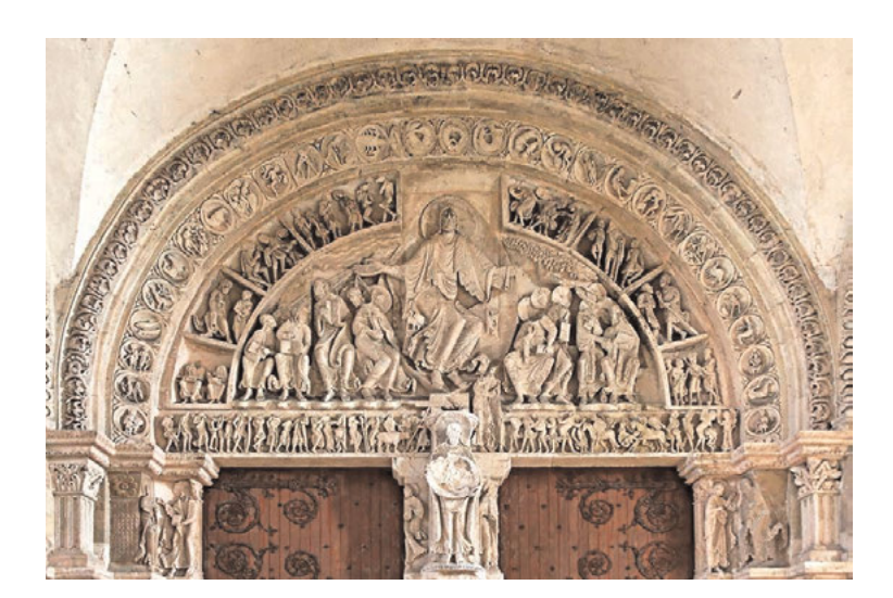
Fig. 3: Vézelay (France), central tympanum of the narthex (ca. 1140–1145), https://commons.wikimedia.org/wiki/Category:Tympanums_of_Vézelay#/media/File:Basilique_Ste_Madeleine_narthex_tympan_central.jpg [last accessed, 1 March, 2020]

It is no coincidence that, starting around 1100, sculptors chose to represent the Last Judgment on the main doors of Romanesque churches:<sup>24</sup> the porch becomes a place of passage for individual penance, indeed a ticket-booth to Purgatory. Around 1140-1145, other sculptors began depicting the Pentecost - to welcome all the gentes – in the central tympanum of the narthex of the abbey-church at Vézelay. This twelfth-century Pentecost scene shows dog-heads and monsters from the North and the East, like in the bestiaries, coming from the ends of the world to demonstrate a newly found unity, the sense of a new creation.<sup>25</sup>