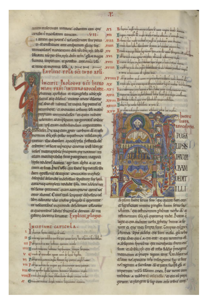
Fig. 4: Initial of Apocalypse, "Bible of Saint-Bénigne", Bibliothèque municipale de Dijon, BM 2 (c. 1125/1130, Burgundy), fol. 470vb.

The monks had lost control of apocalypticism. The example of the Cistercians shows this clearly (Cîteaux was founded in 1098, during the First Crusade). In the Bible of Stephen Harding, abbot of Cîteaux, it is not the monks, but rather St. Michael and the army of angels who – starting with Christ's Incarnation – crush the demons. Abbot Bernard of Clairvaux excludes the idea of the coming of the Antichrist in the near future;<sup>26</sup> he leaves the fight to conquer the Holy Land to warriors and regrets his own involvement in the Second Crusade; along with the monks of his abbey, he instead occupied himself with the daily fight against demons of all sorts and heretics.