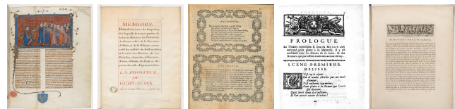
(a) Book 02 (b) Book 05 (c) Book 06 (d) Book 07 (e) Book 10

To provide an informative benchmarking of HDIA methods, many researchers have addressed the need of a realistic ( i.e. it must be composed of real digitized document images), comprehensive ( i.e. it must be well characterized and detailed for ensuring in-depth evaluation) and flexibly structured ( i.e. to facilitate a selection of sub-sets with specific conditions) dataset. Nevertheless, representative datasets of historical document images with their associated ground truths are currently hardly publicly accessible for HDIA. This is mainly due to the intellectual and industrial property rights on the one hand, and the definition of an objective and complete ground truth of a representative dataset of historical document images on the other hand [2]. Thus, in this study we propose to use the dataset associated with the HBA2019 competition 1 , which is the HBA 1.0 dataset. Figure 1 illustrates few book page samples of the HBA 1.0 dataset. More details can be found in [4].