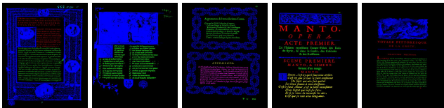
(a) Book 01 (b) Book 03 (c) Book 06 (d) Book 07 (e) Book 10

A set of classes has been used for each book of the HBA 1.0 dataset to define its ground truth. The ground truth of the HBA 1.0 dataset is obtained by annotating each foreground pixel. The ground truth of each selected foreground pixel has been defined by means of a label indicating the content type/class of the analyzed historical document image. Different labels for the selected foreground pixels with different fonts have been also assigned for evaluating pixel-labeling methods to separate various text fonts. Figure 2 illustrates few examples of ground truthed book pages of the HBA 1.0 dataset. Each selected foreground pixel is marked by a color that symbolizes the corresponding content type. The ground truth of the HBA 1.0 dataset contains more than 7,58 billion annotated pixels.