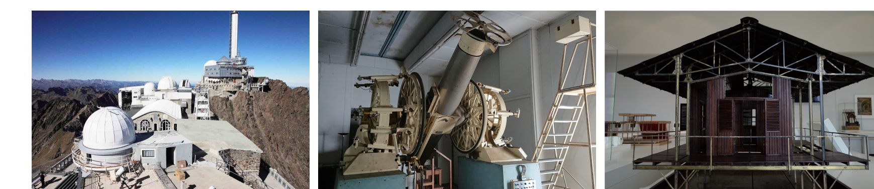
Figure 1: Pic du Midi Observatory. 2011. Photo P. Bastide — A Meridian Circle in Paris Observatory. 2018. Photo L. Jeanson — Mock-up of the Iron House for the Colonies by Moreau frères. Ca. 1890. Musée des arts et métiers. inv. 12002. Photo O. Delarozzière