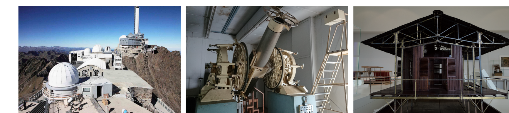
Figure 1: Pic du Midi Observatory. 2011. Photo P. Bastide — A Meridian Circle in Paris Observatory. 2018. Photo L. Jeanson — Mock-up of the Iron House for the Colonies by Moreau frères. Ca. 1890. Musée des arts et métiers. inv. 12002. Photo O. Delarozzière