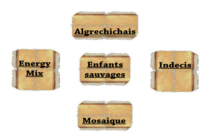
Figure 2. Physical placement of the students during the intercultural course

Individuals largely live in and through structures (as in a Master's course). These structures, and the rules by which they function, establish how much they value cultural diversity in society. The experience of our students working in groups expanded their capacity for intercultural dialog in and between all individuals of different cultures not only in the framework of the course but in what we can become together in our every day life.