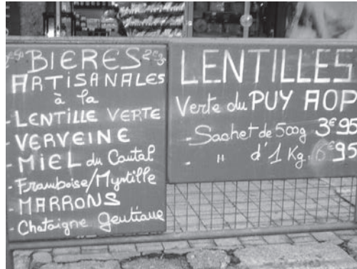
Fig. 1. Often, tourism and agritourism are the main economic return from heritage. In the mountain of the center of France, here at Saugues, because of a rough climate, agriculture is poor; the main production is lentil... The patrimonialisation of the lentil leads to the only protected geographical indication (AOP) of lentil in Europe and, perhaps, the world. There are also craft beers made from local products: lentil, verbena, honey, raspberry, blueberry, chestnut, gentian.

Heritage is part of what Di Meo 1 calls the cultural body of a socio-spatial formation, the collective debate on the production of cultural values and standards