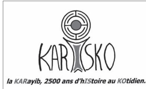
Fig. 4. (Source: LO RUSSO, 2009): Concern for historical truth is secondary to the reinvention of a memory which is sometimes very approximate, and that does not seem to pose any problem: the Ecomuseum village founded by Karisko in the north of Martinique claims some kinship with the Indian ‘ancestors’ of the association’s members and the desire to make their lives part of the island’s heritage, even though the last Indian natives disappeared almost 500 years ago... In fact, this is above all a tourism development project aimed at a Caribbean clientele.

This goes as far as ‘folklorization’, i.e. complete reconstructions (doc. 4), creations which are then called ‘hyper-real’ 8 in order to provide legitimacy to cities or recently developed sites, for example shopping centres (Fig. 5).