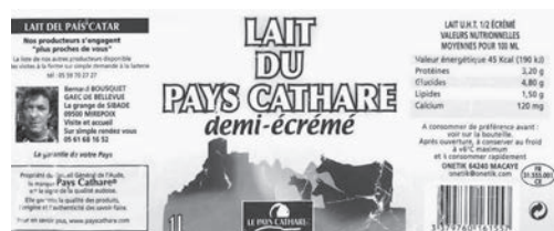
Fig. 3. Cathar Milk: the invention of a Cathar heritage in Aude refers to a fundamentalist Christian sect of the thirteenth century. It has generated a collective momentum whose influence goes well beyond regional boundaries and which brings significant economic benefits through a registered trademark called “Cathar country”.

In the context of territories marked by increasing mobility and radical changes in spatial, productive, political or demographic systems for the last