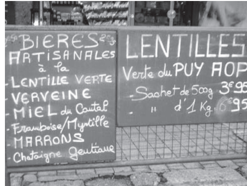
Fig. 1. Often, tourism and agritourism are the main economic return from heritage. In the mountain of the center of France, here at Saugues, because of a rough climate, agriculture is poor; the main production is lentil... The patrimonialisation of the lentil leads to the only protected geographical indication (AOP) of lentil in Europe and, perhaps, the world. There are also craft beers made from local products: lentil, verbena, honey, raspberry, blueberry, chestnut, gentian.

Heritage is part of what Di Meo 1 calls the cultural body of a socio-spatial formation, the collective debate on the production of cultural values and standards