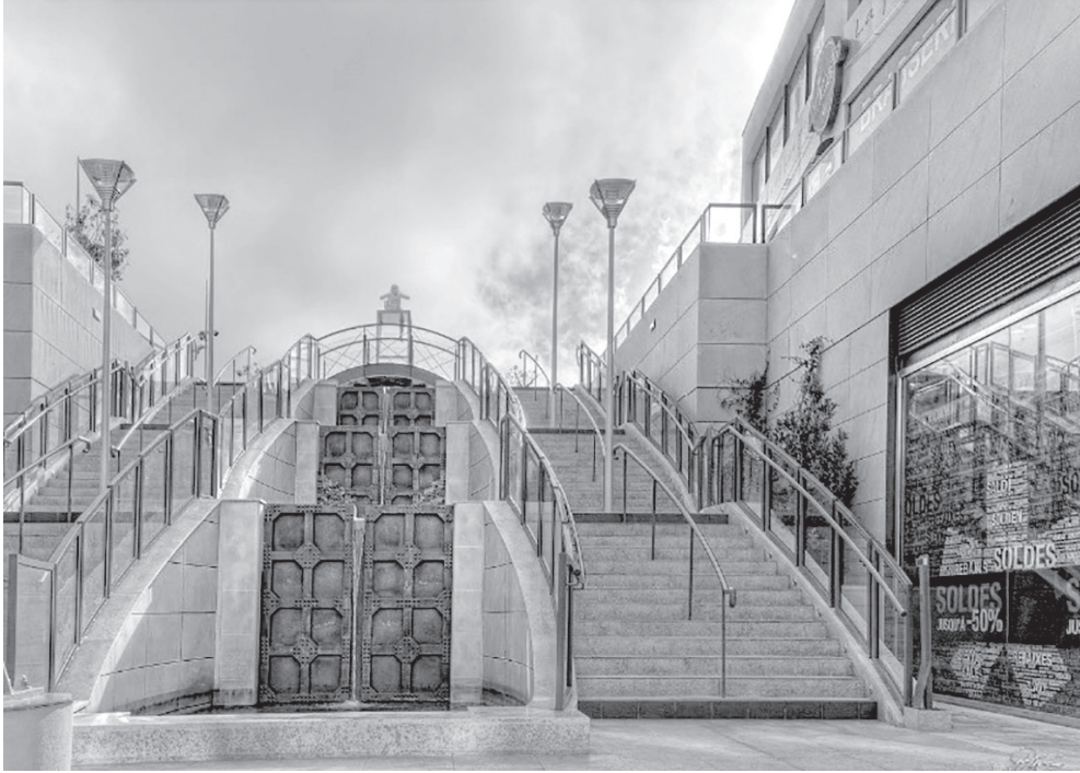
Fig. 8. Hesitating between gadget and urban project? The hyper-real reconstruction of the Fonsérannes locks in the Polygone shopping centre in Béziers. Although the Canal du Midi has been listed as a World Heritage Site by UNESCO since 2004, the site of the nine locks at Fonsérannes has not been particularly well developed until 2017. However, great care has been taken with its reproduction (reduced to three locks). Another copy of this piece of heritage adorns a roundabout at one of the city entrances, a common practice in contemporary heritage status granting.