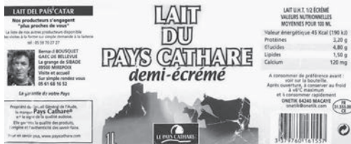
Fig. 3. Cathar Milk: the invention of a Cathar heritage in Aude refers to a fundamentalist Christian sect of the thirteenth century. It has generated a collective momentum whose influence goes well beyond regional boundaries and which brings significant economic benefits through a registered trademark called “Cathar country”.

In the context of territories marked by increasing mobility and radical changes in spatial, productive, political or demographic systems for the last