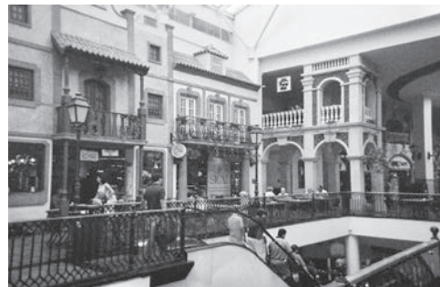
Fig. 5. In Porto, in one of the historical landmarks of the country (the headquarters of the leading Republican newspaper at the end of the 19 th century), the Santa Catarina shopping centre offers recreations of ‘traditional’ house fronts from the north of Portugal. The comments of the architect behind the project are clear: «Why go and look for original houses, located far away and sometimes difficult to access or in poor condition when we can offer you copies in excellent condition, better proportioned [generally reduced by a third] and pleasant to look at?» Five of them were even made up from “regional features”. The end of heritage and the beginning of hyper-reality?