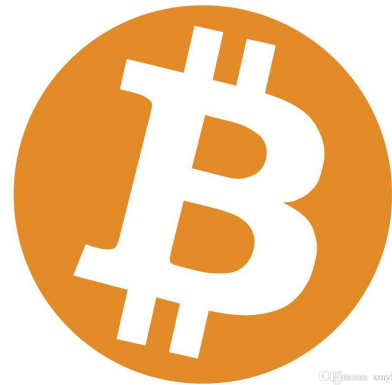
Figure 1: The Bitcoin logo.

Nodes in the network broadcast transactions and can participate in their validation. The process of validating transac-