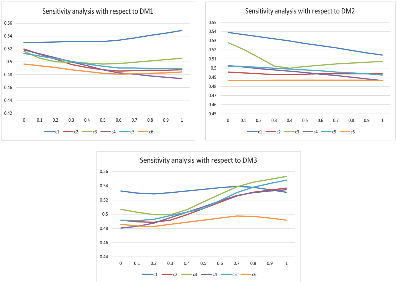
Fig. 3. Sensitivity analysis based on the changes in the weights of decision makers.

is attainable as well which is demonstrated in Table 8.